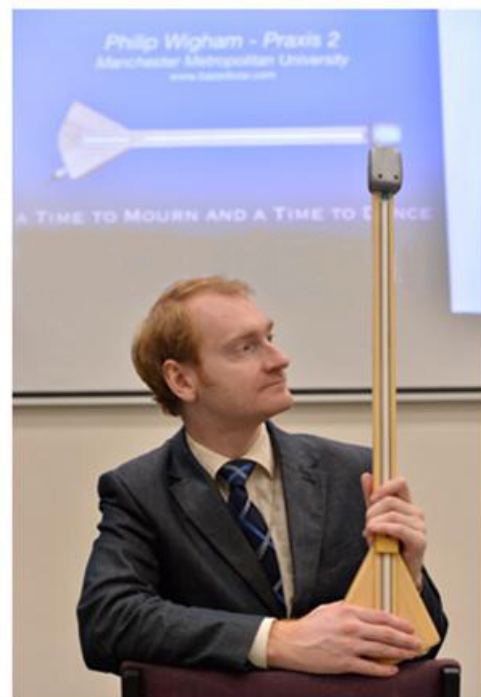
Figure 1. Prototype 1.

The first prototype (Figure 1, the first of three so far) was developed to explore the initial premise of these principles. All prototypes have some basic features that can be found in many gesture-based instruments and that allow simultaneous control of independent parameters. Basic features include a range of sensors to accommodate the independent manipulation of several controls simultaneously, as well as controlling the initiation, length and pitch of the notes. The integration of physical body/movement gestures rather than limiting gestures by using knobs, buttons and faders, allows a full range of small, medium and large gestures creating a much wider range of gestural movement to control the sounds.