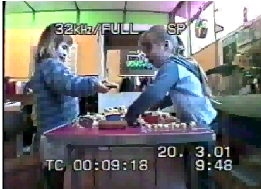
Figure 1: Video Still of reduced pixel count image

Although obscuring image detail in this way may be unsatisfactory for portraying gaze co-ordination or facial expression, it is extremely effective for less focussed representation of body movements, such as construction activities and imitation. Alternatively, sketches of video stills can be drawn to indicate body positioning and directionality of movement.