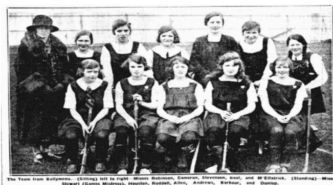
Figure 2. Northern Whig , 17 February 1925, 12.