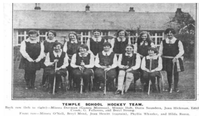
Figure 1. Bucks Herald , 19 April 1929, 5.