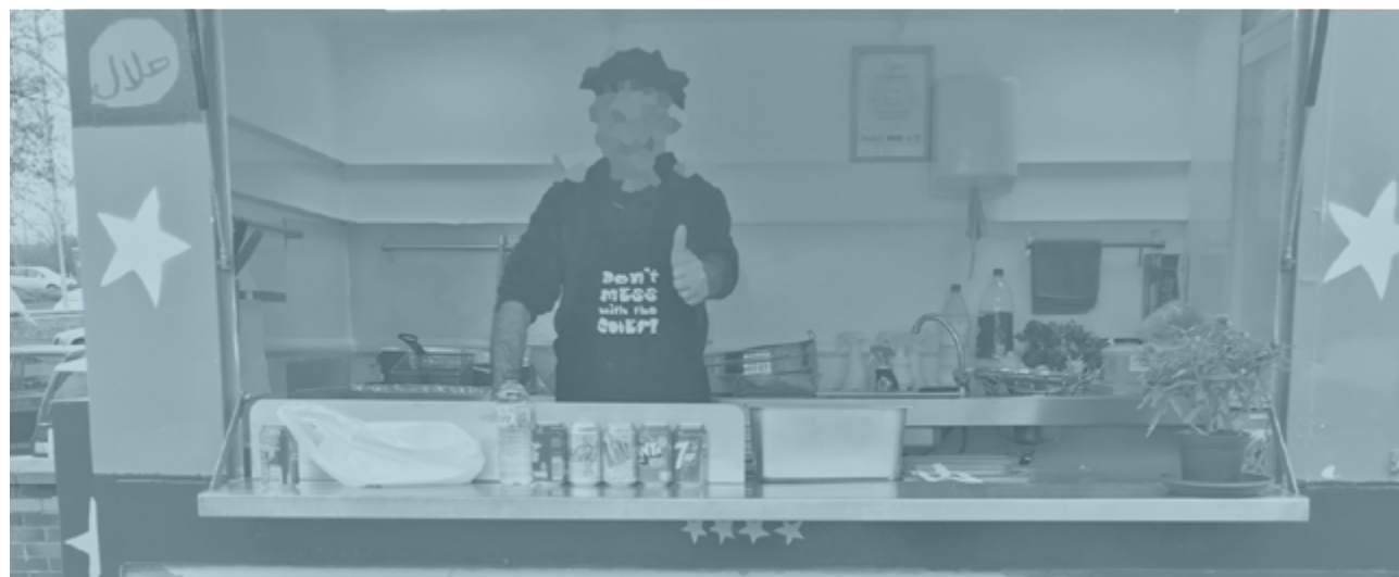
A Syrian refugee start-up entrepreneur, who managed to buy a second-hand caravan with minimal resources, refurbish it, and use to start his own business where he sells authentic Syrian falafel.

Addressing these issues effectively present complex policy challenges. After missing out on a small start-up grant, these refugees eventually received a Government grant during the Covid-19 pandemic, which allowed them to keep the business viable by investing in an online delivery platform.