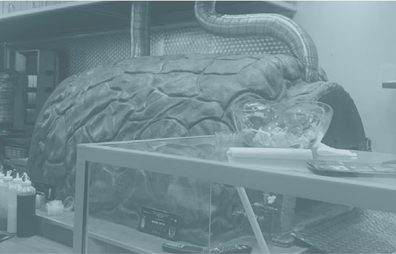
A picture from a restaurant set up in a town by a Syrian refugee.

This was particularly evident in food and culinary businesses: