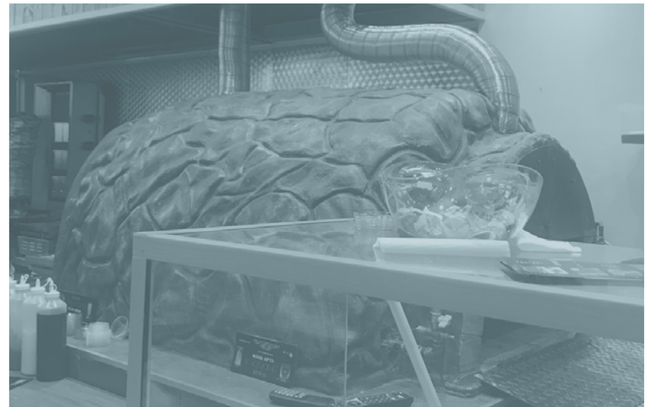
A picture from a restaurant set up in a town by a Syrian refugee.

This was particularly evident in food and culinary businesses: