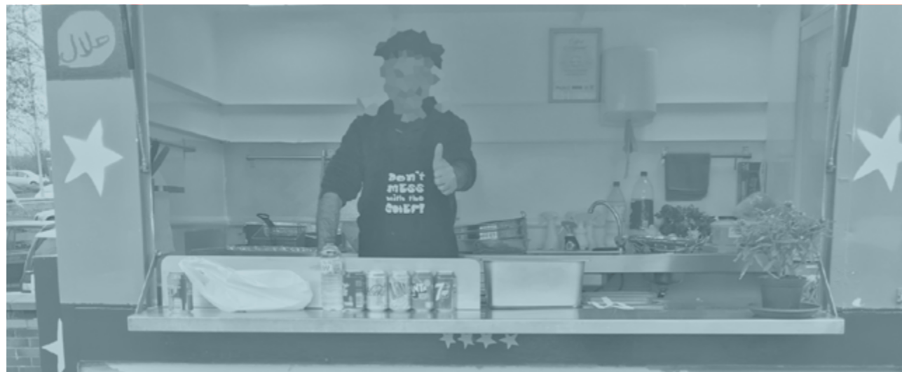
A Syrian refugee start-up entrepreneur, who managed to buy a second-hand caravan with minimal resources, refurbish it, and use to start his own business where he sells authentic Syrian falafel.

Addressing these issues effectively present complex policy challenges. After missing out on a small start-up grant, these refugees eventually received a Government grant during the Covid-19 pandemic, which allowed them to keep the business viable by investing in an online delivery platform.