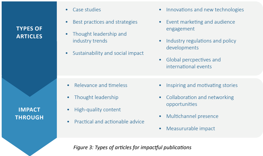
Figure 3: Types of articles for impactful publications