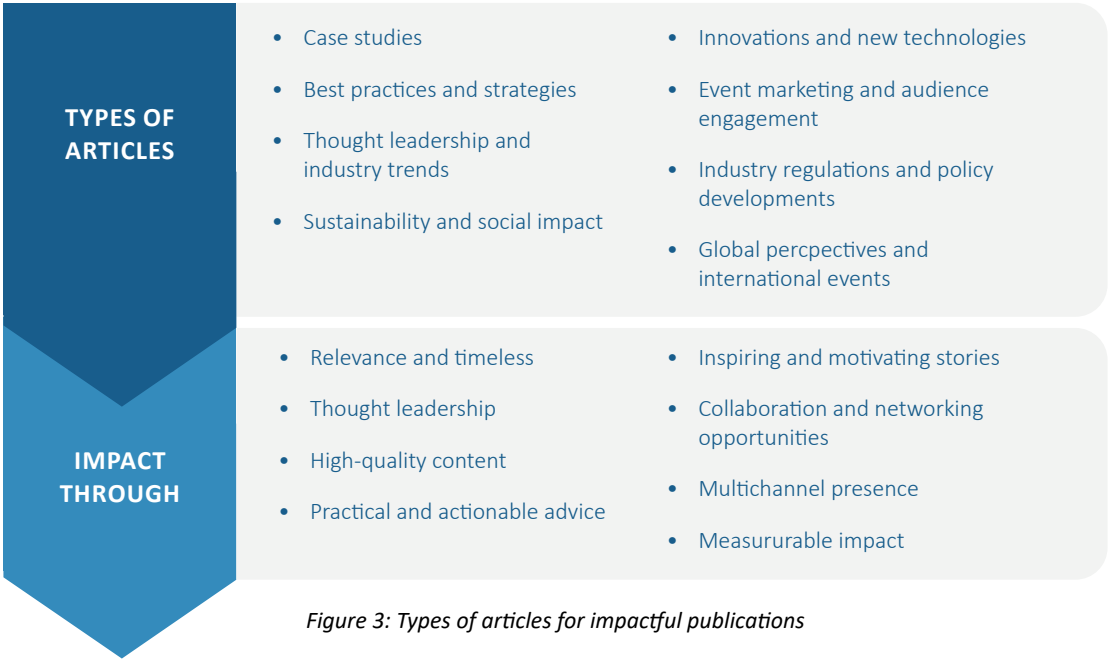
Figure 3: Types of articles for impactful publications