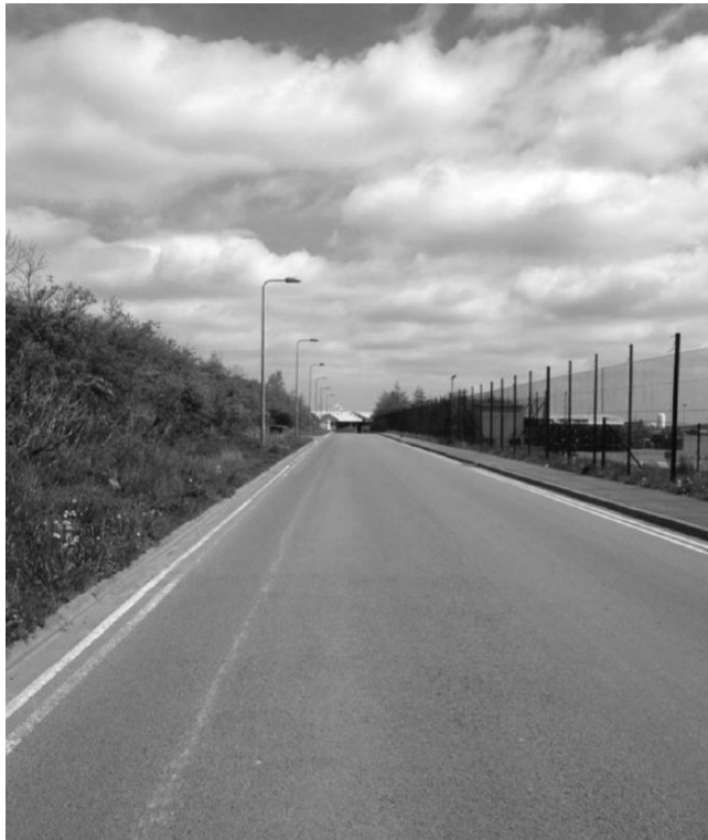
Figures 1 and 2. The Road to Nowhere: The approach to a meat-processing factory near Merthyr Tydfil in the Welsh Valleys.