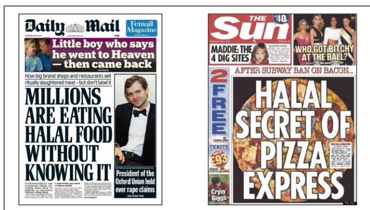
Figure 4: Halal hysteria headlines from The Daily Mail and The Sun , May 2014

What was subsequently termed ‘ halal hysteria ’ came to a head in May 2014 (Allen, 2014; Sommers, 2014). During a heightened period of UK media reporting, restaurant chains such as Pizza Express and Subway were accused of sourcing halal ‘only’ chicken without informing their customers, the implication being that millions of UK citizens were eating halal meat without knowing it. At the same time, supermarkets such as Waitrose, Marks & Spencer, Tesco, and Morrisons were accused of selling halal meat imported from New Zealand without labelling it such. Although it was subsequently reported that all such meat came from pre-stunned animals, this did little to alleviate growing public anxiety; this situation was reflected in local press reports, with high street butchers in small UK towns reporting increased public anxiety about how their meat was produced (see The Shropshire Star , 2014). At the height of this media driven frenzy, Brummer (2014) argued in The Jewish Chronicle that the UK media is driven by an increasing ‘ fear of the alien ’, much as it had been a century earlier. Research suggests similarly that in a number of European countries, notably the UK, media generated political discourse links the availability of halal meat and methods of slaughter to wider concerns about migration and integration (Bradley et al., 2015).