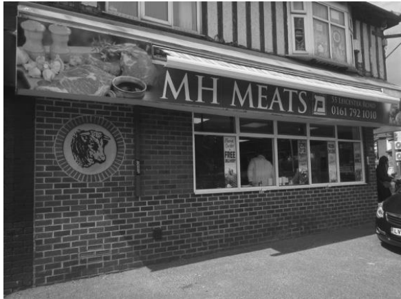
Figure 2: The ultra-orthodox ‘MH Meats’ shop in Salford, Manchester. 9

Growing Nazi propaganda and anti-Semitism during the 1930s meant that political interest in religious slaughter waned considerably during the mid-20 th century. In the post war period, attention also began to turn towards the UK's growing Muslim population and their culturally preferred method of slaughter ( dhabiha ). After the Holocaust, debate about religious slaughter in Europe also began to shift away from anti-Semitism towards animal rights, though Gilman (2011) suggests the two views remain linked. Moreover, in an emerging pluralistic and multicultural cultural context, the media would arguably come to play a much greater role encouraging dispute to strengthen bias towards the hegemonic (pre-stun) preferences and unpalatable (non-stun) alternatives unpinning the ‘ hegemonic food discourse ’ (Roslyng, 2011). It is to these issues and the ensuing debate over halal meat and dhabiha slaughter practice that I now turn.