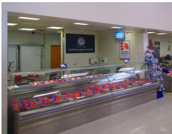
Figure 3: A National Halal Centre for fresh non-stunned halal meat in Tesco

When the HFA was formed in 1994, the production of halal meat and poultry (mostly chicken) was segregated from non-halal meat production in slaughter plants and processing facilities (Lever and Miele, 2012). As the market continued to expand this practice became more expensive and difficult to maintain, and both ' non-halal stunned meat ' and ' stunned halal meat ' was subsequently produced in an almost identical way at the same slaughter facilities and processing factories to reduce costs. As media driven sensitivities around halal meat continued to intensify in the coming years, supermarkets, restaurants and public institutions in turn became more discreet in obtaining and displaying the halal logos of their certification partners (Fazira, 2015). In many such instances, it appears that halal meat is not labelled as such, or the slaughter method is hidden from view, because of business fears that a hostile political climate, negative media reporting and growing public hostility may impact business reputation (Lever and Fischer, 2018). This lack of transparency in the UK meat industry has, aided by negative media and newspaper reporting, arguably undermined public understanding of halal meat and dhabiha slaughter practice considerably.