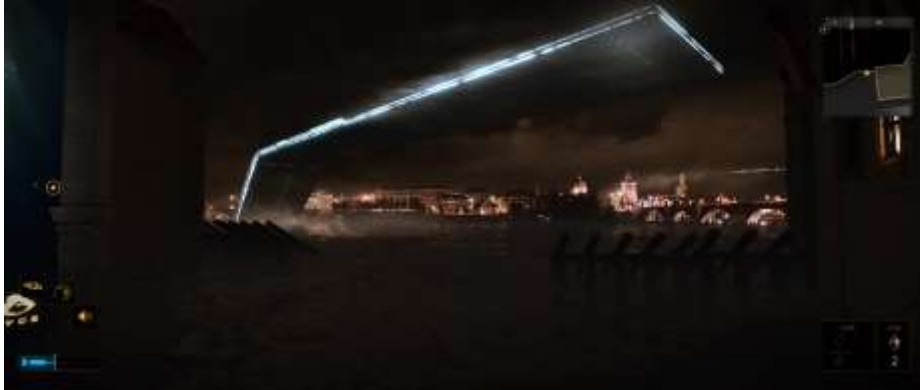
Fig. 4. The Palisade Blade data-archiving facility building dominates the skyline of Prague in Deus Ex: Mankind Divided © Eidos-Montréal 2016.

which, in line with the current trend, aims to represent a transparent, clear, and honest institution. Naturally, we can see the same techniques used in digital games to connote narrative clues to the players. For instance, in the cyberpunk RPG Deus Ex: Mankind Divided [11], the corporations of the dystopian future when the game is set manifest their power with impenetrable monolithic structures (see Fig. 4).