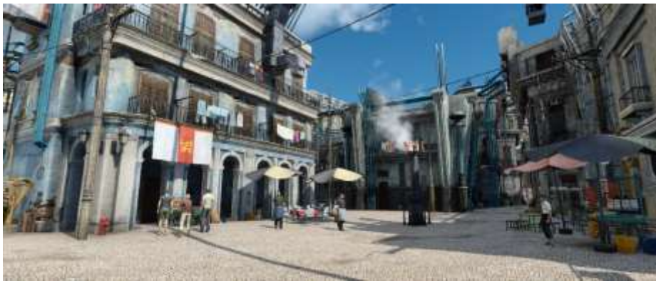
Fig. 5. The city of Lestallum in Final Fantasy XV © Square Enix 2016.

to play, they give indications on where to go next, or which areas might be dangerous and which ones are safe. In a role-playing-game the sight of a city is usually interpreted as a sign of a safe space, such as the city of Lestallum in Final Fantasy XV [13], where the players can expect safety from the dangers of the wilderness, and points of interest where to communicate with other characters and acquire items in shops. The looks of the city itself express its role as a safe hub, the squares are lined with shops and cafes, and only humans populate its streets (see Fig. 5). Conversely, in a first-person shooter, where the interaction is usually limited to shooting and being shot at, a city can be a dangerous place, full of hideouts for the enemy, but also a location that offers numerous covers and gameplay possibilities.