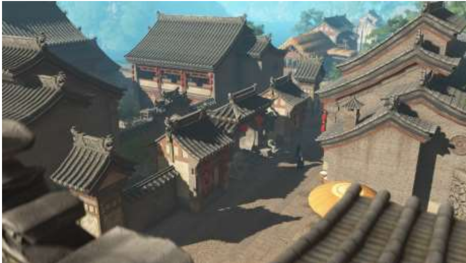
Fig. 6. The city of Yangping in 古劍奇譚三 (Gujian3) © Aurogon Shanghai 2018.

In Gujian 3 the “mortal” realm, as in, our normal world, is traditionally represented with vernacular Chinese architecture, as we can find in reality (see Fig. 6). The “spiritual” realm instead, in order to be clearly differentiated from the mortal one, takes architectural cues from a mix of Western architectural and Japanese digital games tradition. The buildings of the city of Skyelk (see Fig. 7) are designed in a whimsical art nouveau styles mixed with Nordic elements, which more than accurately resembling real examples of these architectural styles – such as the works of architect Hector Guimard, who designed the Paris Metro entrances in 1900 – takes inspiration from the reinterpretations we can see in Japanese role-playing games, especially in the Final Fantasy series [16].