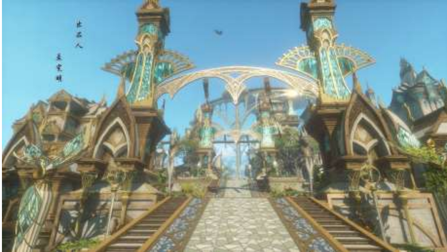
Fig. 7. The spiritual realm city of Skyelk in 古剑奇谭三 (Gujian3) © Aurogon Shanghai 2018.

The dichotomy between the two worlds, the mortal and the spiritual, is thus highlighted through the connotation of their architectural design. In order for the players to understand that they are in a world radically different from the normal one, the choice of an unusual architectural style is a most effective way to achieve this effect. Naturally other elements help players understand the narrative and situate themselves within the game world, there are characters who are dressed differently, as well as dialogues explaining the context, but the effectiveness of architecture communicates the otherworldliness of the location without even the need of additional explanations.