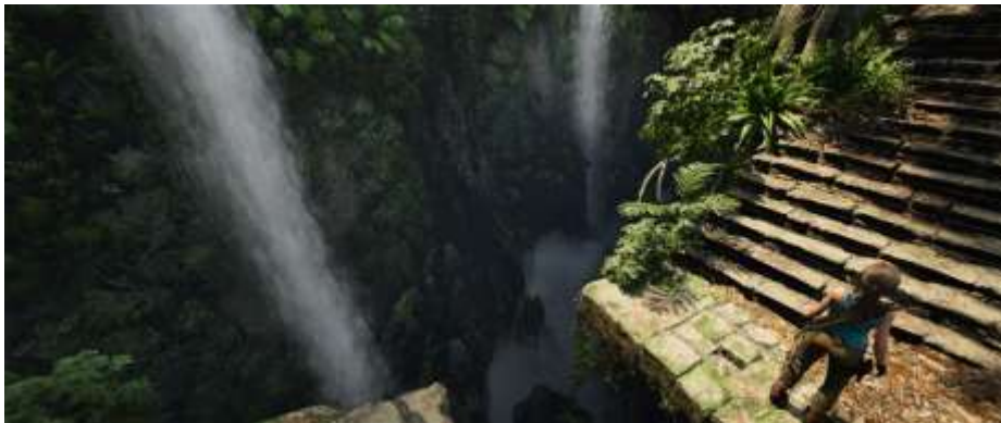
Fig. 1. A scene from Shadow of the Tomb Raider

Here we can draw a parallel with the concept of utilitas , brought forth by Roman architect Vitruvius in his De architectura , the only surviving Western architectural treatise of the ancient world, written in the 1 st century BCE. Vitruvius recommends that all buildings be built in a way that is appropriate to their use, location, and occupants. In digital games, virtual architecture has to be equally designed to be appropriate to the gameplay style, players and level type. The architectural design of a level of a third-person action-adventure game such as Shadow of the Tomb Raider [8] (see Fig. 1), where players have to jump, climb, and fight, will be different from a first-person horror game such as Layers of Fear [9] (see Fig. 2), where there is no combat, but rather exploration aimed at building tension. Furthermore, virtual architecture is not limited to satisfy gameplay needs, but it also determines the characterization of the environment and the tone of the game. The aforementioned Layers of Fear is set in a haunted mansion, which characterizes the game as horror, and would of course have been a completely different experience if the architectural background was, for instance, a colourful shopping centre.