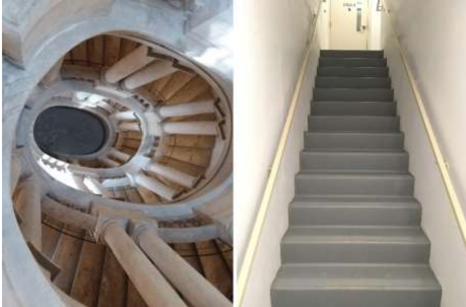
Fig. 3. The monumental staircase in Palazzo Barberini, Rome, designed by Francesco Borromini in 1633 (left), and an emergency staircase in a high-rise building (right).

However, it is not hard to notice how the appearance of the two staircases differs. Evidently, while the primary denotative function is the same in both, the secondary connotative function led to visually very different designs: a monumental, colonnaded, spiral staircase in Palazzo Barberini, and a simply painted straight staircase in the high-rise condo. Naturally, this difference is also due to their primary denotative function. Borromini's staircase is one of the two main staircases in the palace, and the principal way of moving between floors, whereas the emergency staircase is designed to be used only in exceptional circumstances. As such, the secondary connotative function is a consequence of the primary one: firstly, the staircase is shaped as such for the necessity of fulfilling the function of a staircase, and secondly it is designed in a certain way based on its use and the image it wants to convey.