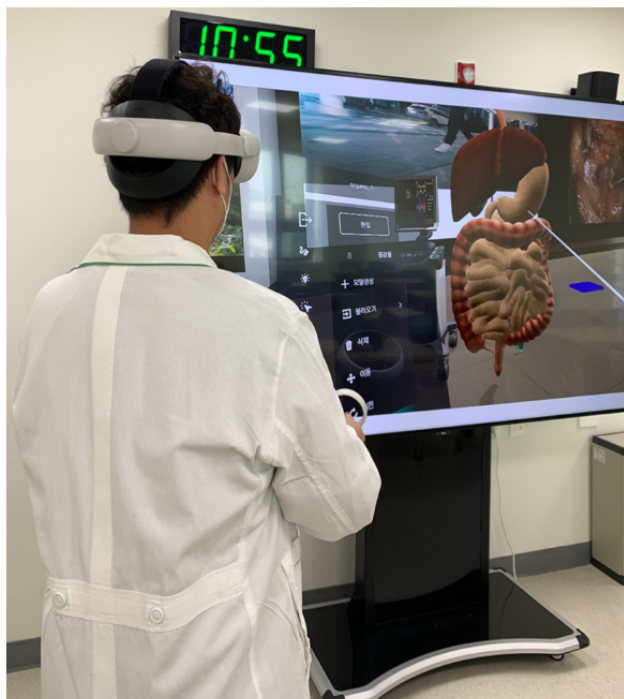
Figure 2. Pictures of participants using Dr. Meta.

criteria for the study were having experience using this metaverse platform but being aged less than or equal to 19 years, being unable to complete self-reported surveys, having a serious physical or mental condition that prevents them from participating in the study, not consenting to the survey, or withdrawing consent during the study. A daily necessity worth about $5 was provided as compensation for participating in the study. We did not ask for information that could identify participants (eg, name and social security number), so the data used in this study was deidentified. Figure 2 shows the participants who used the metaverse platform.