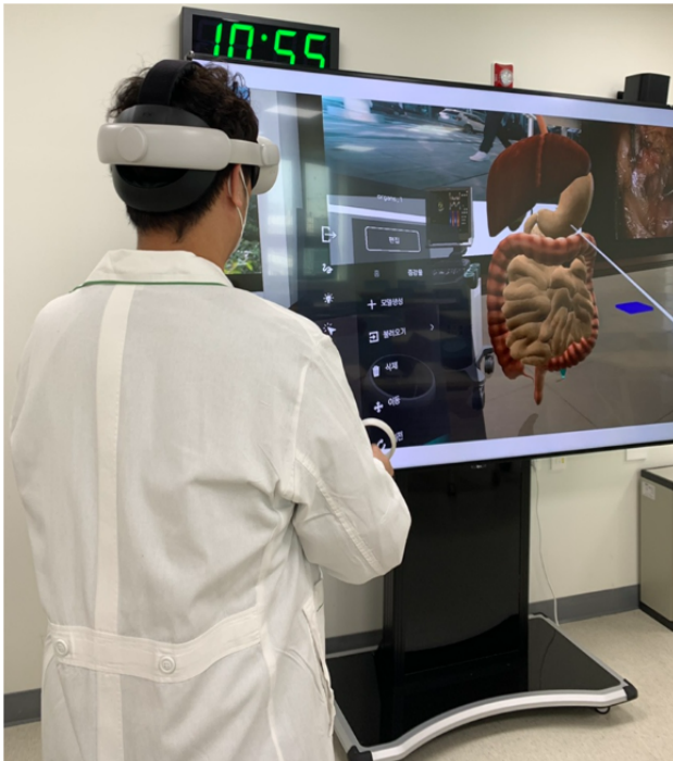
Figure 2. Pictures of participants using Dr. Meta.

criteria for the study were having experience using this metaverse platform but being aged less than or equal to 19 years, being unable to complete self-reported surveys, having a serious physical or mental condition that prevents them from participating in the study, not consenting to the survey, or withdrawing consent during the study. A daily necessity worth about $5 was provided as compensation for participating in the study. We did not ask for information that could identify participants (eg, name and social security number), so the data used in this study was deidentified. Figure 2 shows the participants who used the metaverse platform.