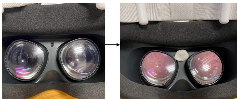
Fig. 3. Covering the proximity sensor which is located between the two eye lenses.

The sdcard.tar.gz file was converted to a TAR file using 7-zip , an open-source file archiver. Both TAR files ( sdcard.tar and adb-data.tar ) and the Live Data folder (see Table 2), were examined using the software Autopsy to find data related to the user activity and device information that could be relevant for forensic examiners.