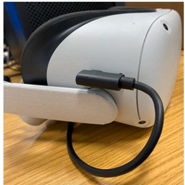
Fig. 1. The Meta Quest 2 headset is connected via a USB-C cable.

By default, adb is not enabled on the headset and can only be achieved by enabling both Developer Mode and USB debugging (Defence Science and Technology Laboratory, 2022). This was accomplished by upgrading the primary Meta (user) account associated with the device to a 'developer' account via the Meta Quest developer's website (Meta Developer, 2022). We then proceeded to download and install the Meta Quest app on an iPhone from the Apple App Store. Once the app was installed, we logged in using the new developer account. Bluetooth was enabled on the smartphone, and we paired the Meta Quest 2 headset to the app. Once paired, we enabled Developer Mode through the app Menu->Devices -> The Meta Quest 2 headset -> Headset Settings -> Developer Mode -> Toggle Developer Settings on as shown in Fig. 2. With Developer Mode enabled on the headset, we could access data through the developer account.