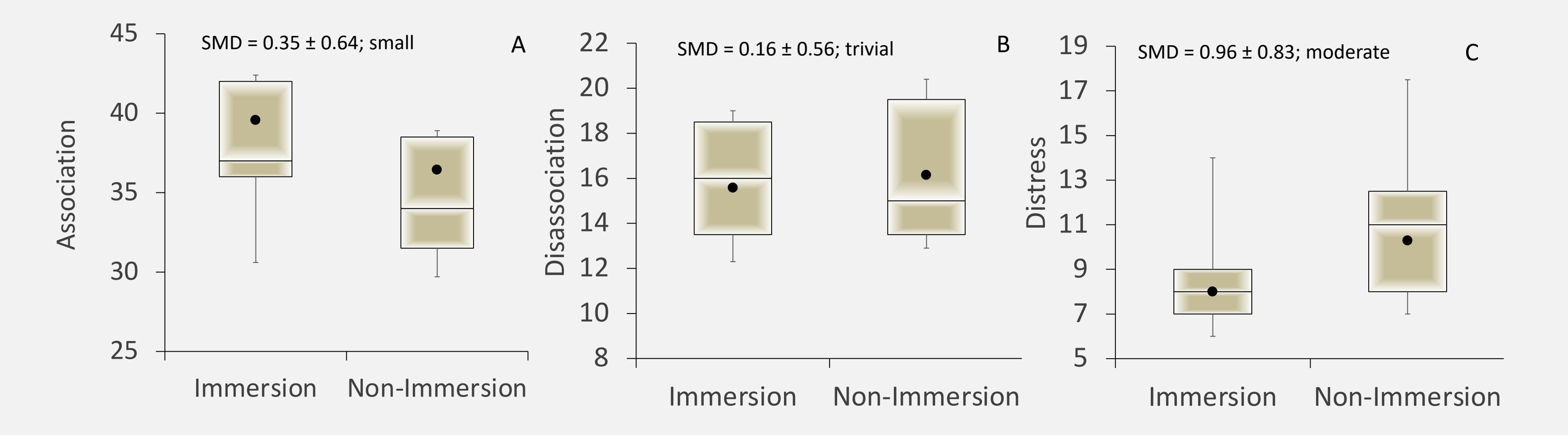
Figure 2. Differences in association (A), disassociation (B) and distress (C) between environments.