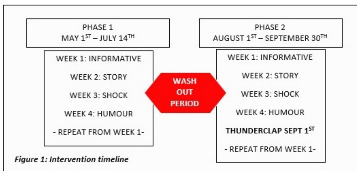
Figure 1: Intervention timeline