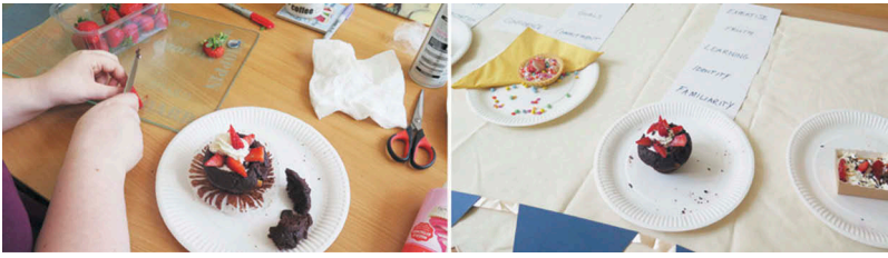
Figure 4. Making cakes for future PTC partners. The cakes were then displayed and used as prompts to describe valuable qualities or ‘ingredients’ of trust that future partners would need to bring to the partnership.