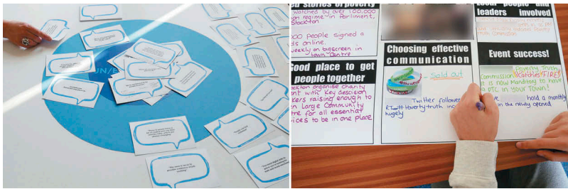
Figure 1. Workshop 2 mapping quotes and envisioning exercise with newspaper template.