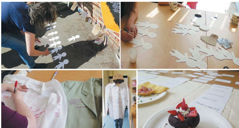
Figure 2. Workshop 3 mapping potential partners, costume annotation, role play and cake making.

To extend this discussion we also used food to encourage the group to reflect on its potential vital role in facilitating enjoyable ways of sharing time together with the potential to break down more formal or hierarchical barriers. In responding to the significance of collective food sharing in previous sessions (i.e. a good lunch was always provided and appreciated by volunteers) we then created cakes as imagined gifts for the influential people the group were interested in engaging with. Using single words written on postcards to articulate different facets or ‘ingredients’ of trust next to the cakes, we used these to prompt further discussion on what participants felt were