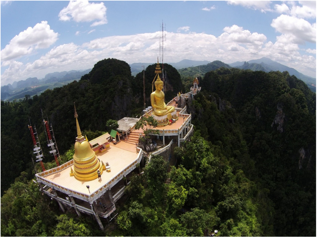
Figure 6. Access to inaccessible places in drone photography.

and truthful and, therefore, less problematic in their interpretation than balloon or plane photography.