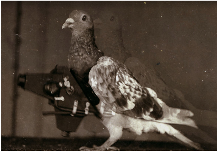
Figure 1. The pigeon camera.

image of doves as German dive-bombers in T.S. Eliot's Little Gidding (1942) and falcons as Spitfires in the film A Canterbury Tale (1944). However, the connection dates back even earlier to 1903: a year that saw the Wright Brothers fly the world's first motor-operated airplane and Julius Neubronner invent the pigeon camera – the focus of this study.