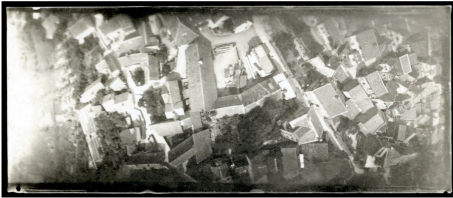
Figure 3. Verticality in pigeon photography.

Details on the tops of buildings that may never be engaged with directly in real life – tiles, window-panes, generators – are presented close-up, encouraging textural engagement with their metal, ceramic, and glass (Ledin and Machin 2018, 157). Through the top-down angle, a “personalized aerial space” (Hildebrand 2019a, 399) is fostered that not only distorts our typical understanding of cityscapes and expands human vision, but challenges us to remake our existing relationship with our geographical surroundings. Thus, here, subject and object are not in opposition to one another, but rather merge to become a “conjoined machine of seeing” (Maurer 2021, 31).