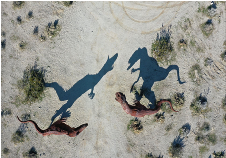
Figure 4. Geographical reimaginings in drone photography. Source: Eric Hanscom, @dronezoneclub Facebook.

conditions: the effects of sun, wind, rain, or snow can alter the way we see a landscape and even transform seemingly mundane views into spectacular sights. In other cases, these reimaginings are the result of tricks of light or shadow play, which can change tones and perspectives, thereby transforming viewers' emotions as they are exposed to subtle details of a site's geography. In others still, it is the framing or angle that can confuse our sense of spatial orientation and, therefore, thrust us into an atmospheric space in which we struggle to orient ourselves and must search for what is held within the image (Wilkinson 2013, 11).