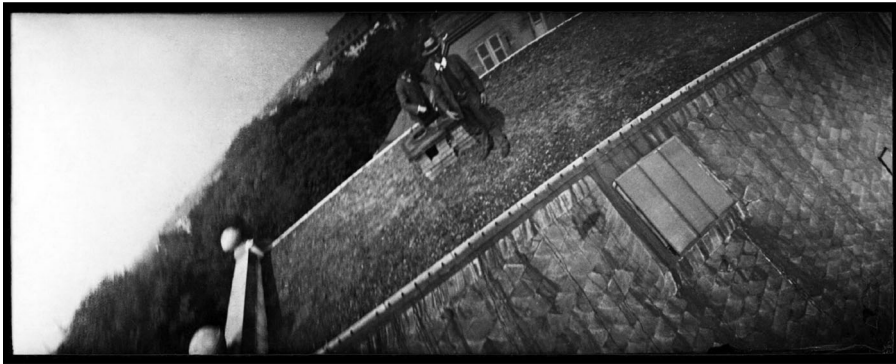
Figure 9. Aerial self-portraits in pigeon photography.