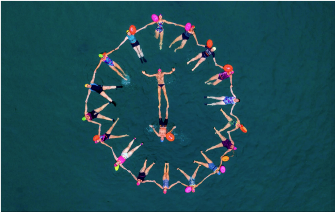
Figure 8. Aerial self-portraits in drone photography.

This brings about a sense of empowerment as the individuals “hijack surveillance” (Jablonowski 2017, 103) and retain certain agency in the face of the aerial gaze. Although people are the focus of the image, the drone is more concerned with capturing the patterns that they make rather than the individuals themselves. In other words, cinematic views are foregrounded with the camera ascending away from the people in a zoom-out effect. This means that little attention is paid to the gestures, facial expressions, and appearance of the depicted people, which reverses the relationship between humans and their surroundings found in typical selfies. These aesthetics also disrupt our understanding of traditional image acts and gaze because the participants do not form “vectors” (i.e. eyelines) with the viewer, nor do they “offer” or “demand” anything or carry out material actions (Kress and van Leeuwen 2006, 117); rather, they are turned into abstract still life images with a dense, three-dimensional sense. This