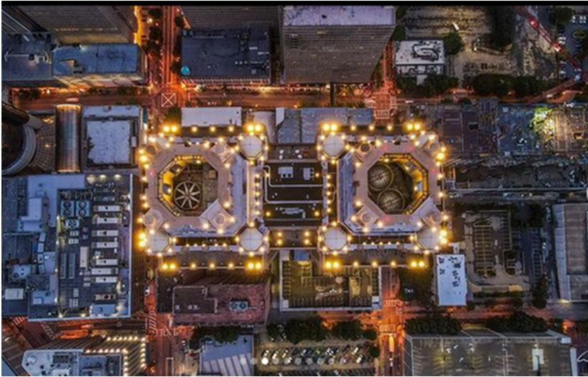
Figure 2. Verticality in drone photography.

Maurer (2021) call it, dissolve hierarchical boundaries between subject and object and, in fact, offer opportunities for artistic expression. The flattening offered by the vertical angle, thus, expands the world into an “indefinite and diffused space without clear, fixed boundaries” (ibid, 28) and grants an “intimate and reciprocal mélange between the ground and the sky” that diversifies verticality as an exercise of power and reassembles new and old forms of knowledge and expertise (Pauschinger and Klauser 2020, 462). Vertical images can make landscapes feel more tactile than visual because angle is distorted and increased attention is paid to the textures of the landscape, which produces views that are distinct from those we perceive from ground level. Thus, a synesthetic space is created that establishes an alliance between power and visibility, offering viewers opportunities to reimagine the visuality of the view from above as that of dominance, power, and control (ibid 2020, 463).