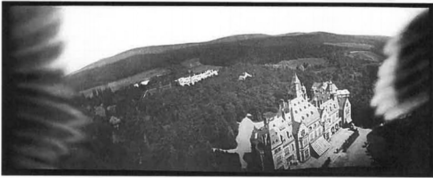
Figure 7. Access to inaccessible places in pigeon photography.

what we see does not actually represent what the pigeon sees because the camera is strapped to its breast, not its head. Therefore, our image can only ever be an imaginary as the pigeon's wings accentuate its position in a reality of which we can never really be part due to our inability to fly (Wilkinson 2013, 10). In this way, the pigeon's view never represents one truth, but rather certain things, places, and ideas that are always partially bound in fantasy (Ledin and Machin 2020, 65). Other photos in the same series show close-ups of the palace, indicating how the pigeon successfully navigates the private gardens in the guise of an innocent bird rather than a surveilling apparatus. In doing so, it makes visible structures of power (i.e. the royal family) that typically operate through invisibility, thereby reversing the gaze in a symbolic sense or, as Paglen states, turning "the masters of surveillance" into the "surveilled" (cited in Wilkinson 2013, 12).