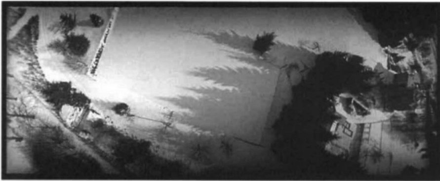
Figure 5. Geographical reimaginings in pigeon photography.

shadows foster a deeper encouragement with our surroundings, making us think of and interact with them in new ways, but at the same time, they also produce a “symbolic suggestive process” (Kress and van Leeuwen 2006, 106), capturing an “essence” or “mood” rather than a specific moment. This emphasis on human emotion and how aerial photography can affect thoughts and behaviors shows that “vertical mediation” (Parks 2016) is not necessarily a force for evil and can, in fact, encourage positive reactions when used in a domestic context. This is in line with Amad (2012, 25) and Mangold and Goehring’s (2019, 29) belief that the aerial view is always situated between the dialectical poles of “science and art, rationality and imagination, abstracted and embodied knowledge, visibility and invisibility.” In other words, it is in these liminal areas that a range of rhetorical and imaginative, rather than problematic and threatening, potentialities emerge from the photographic encounter.