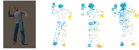
Figure 2: Different possible shapes for the same image.

With the EMD-based loss function, the system can effectively evaluate the distance between the synthesized human shape and the ground-truth one for backpropagation during training.