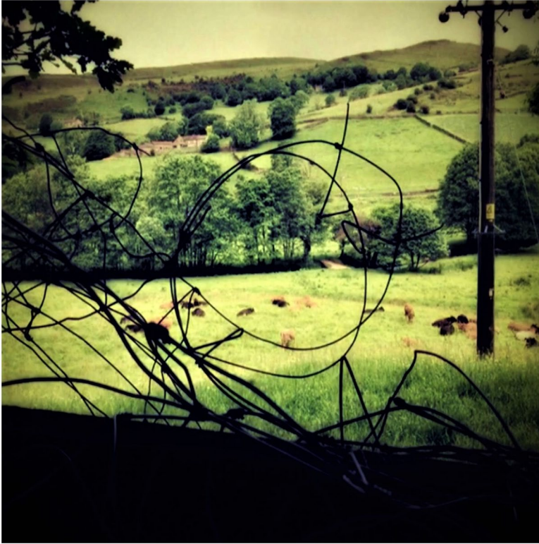
Figure 4. Rural Eerie promotional image and album cover.