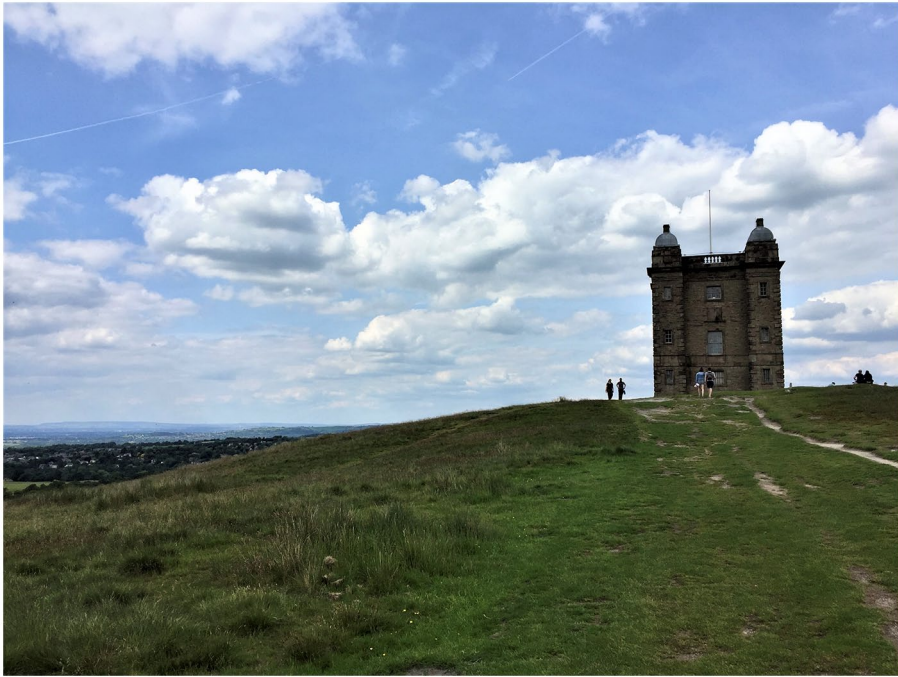
Figure 3. 'The Cage' in Lyme Park, Cheshire.