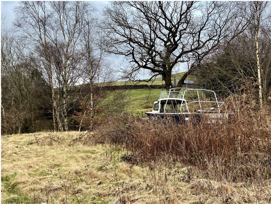
Figure 1. A decaying boat in a field in Derbyshire.