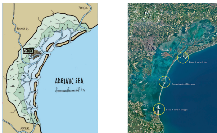
Fig. 1. The Venice lagoon in the 15 th century (left) and today (right).

This paper evaluates the existing and proposed mitigation options that are carried out to reduce the multi-hazard vulnerability of the Venice lagoon and the surrounding area. It carries out a review to establish the objectives, responsibilities, instruments and measures that were employed for carrying out these safeguarding activities. The paper examines the impact of the mobile tidal barrier system (MOSE, started in 1987 and to be completed in 2014), coastal reinforcement measures, the raising of quaysides, inner canal dredging and the paving and other infrastructure improvements to mitigate the impact from flooding which are designed to protect Venice and the lagoon. The impact of early forecasting and warning systems, improved communications to all stakeholders and service providers to improve rapid responses is also discussed.