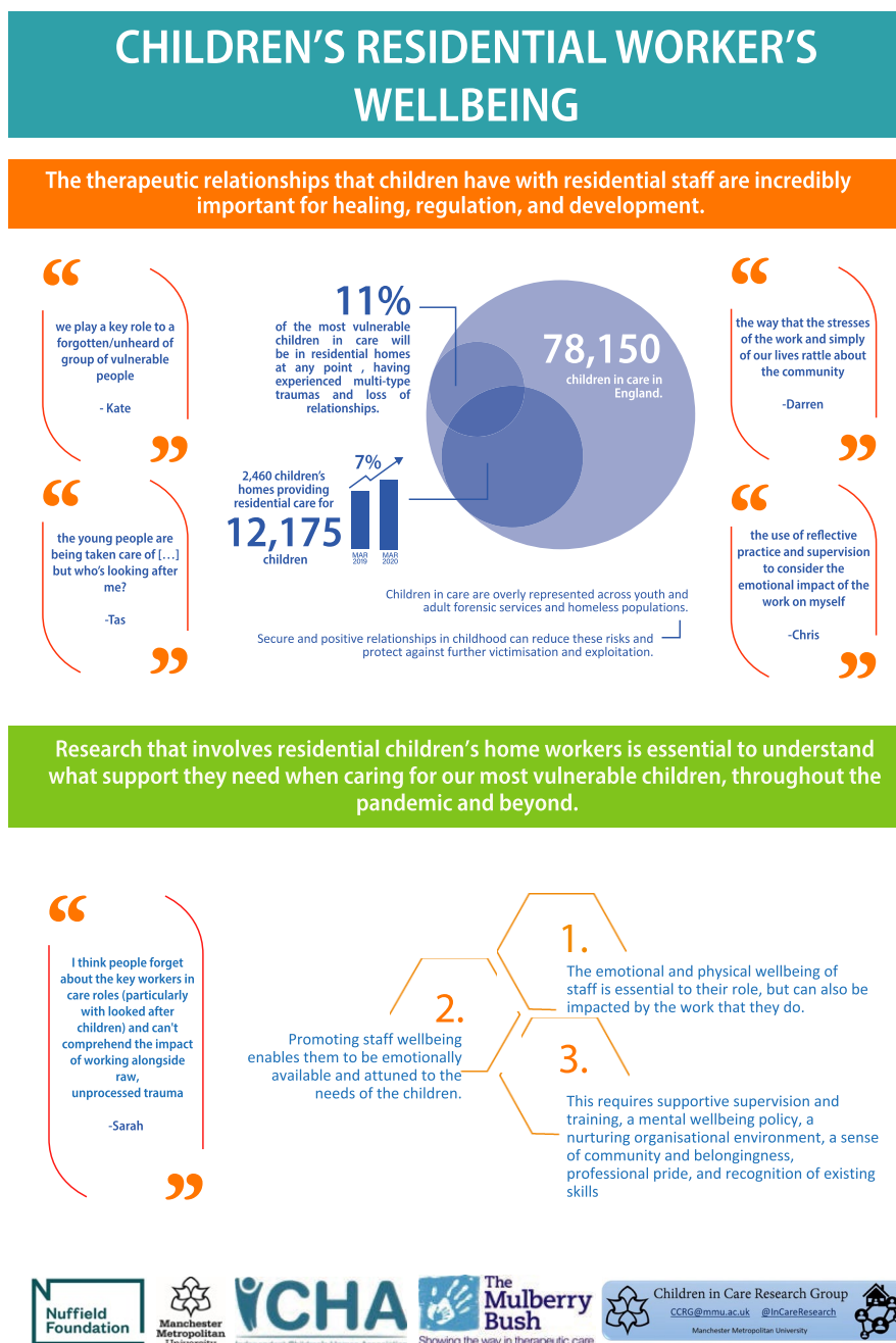
FIGURE 2 Infographic from national and study data