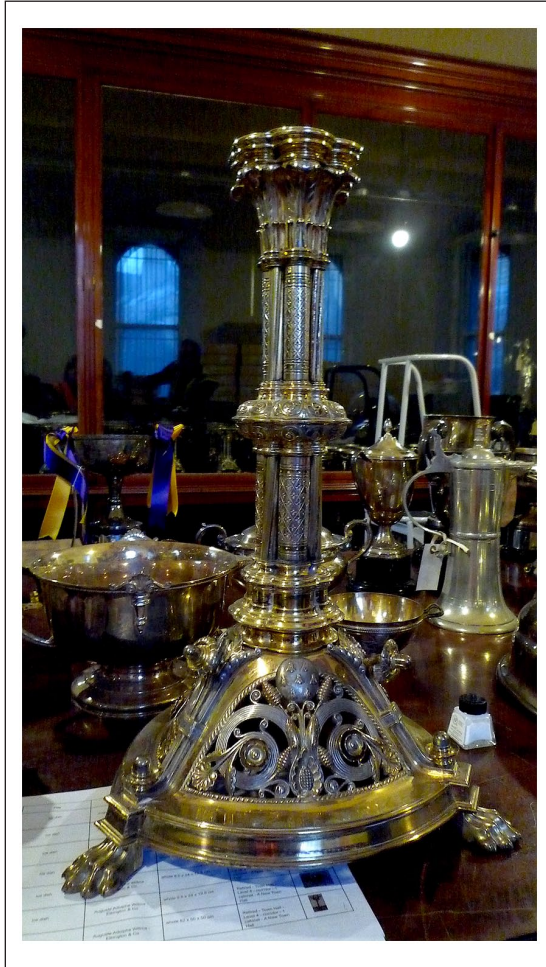
Figure 2. Candelabra from civic plate on a table in the silver room, along with other silver objects.

When we witnessed this overflowing silver scene, many objects had been placed on the central table in readiness for off-site storage. We were bedazzled by an overabundance that conjured the protean political and social exchanges of a municipal council for over 140 years. Our gaze snagged on particular artefacts but was subsequently distracted by other objects that stood out from the material profusion. The scene might be compared to a Wunderkammer, organized, according to Büscher et al. (1999: 4), in a way that avoids imposing ‘an ordered set of relationships and ways of interpreting on the user’. Weston (2009: 38) maintains that such cabinets of curiosity return us to a non-Euclidean, ‘traditional, mytho-poetic understanding of the world as a sacred hierarchy, full of marvels, mystery and magic, and only partially accessible to human intellect’. Thwarting the