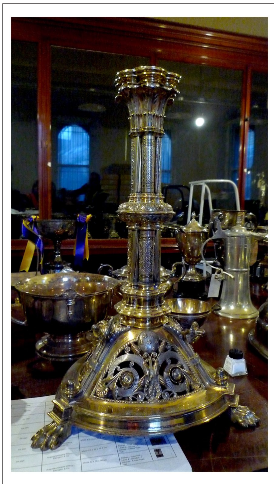
Figure 2. Candelabra from civic plate on a table in the silver room, along with other silver objects.

When we witnessed this overflowing silver scene, many objects had been placed on the central table in readiness for off-site storage. We were bedazzled by an overabundance that conjured the protean political and social exchanges of a municipal council for over 140 years. Our gaze snagged on particular artefacts but was subsequently distracted by other objects that stood out from the material profusion. The scene might be compared to a Wunderkammer, organized, according to Büscher et al. (1999: 4), in a way that avoids imposing ‘an ordered set of relationships and ways of interpreting on the user’. Weston (2009: 38) maintains that such cabinets of curiosity return us to a non-Euclidean, ‘traditional, mytho-poetic understanding of the world as a sacred hierarchy, full of marvels, mystery and magic, and only partially accessible to human intellect’. Thwarting the