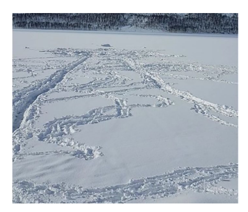
Figure 4. Lines in the snow after ice-fishing.

During our fieldwork, we became aware that the paths the children tended to make during their wayfaring ( Hackett , 2016) remained visible afterwards as tracks in the snow. We began photographing snowy spaces before and after the children had visited. Figure 1 shows a before shot of the frozen snow covered lake as a blank slate, and Figure 4 shows the same space after the children had got back on the bus.