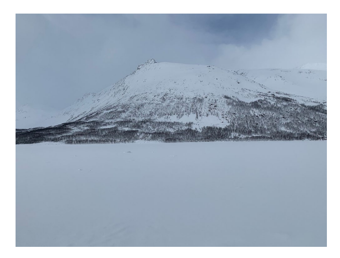
Figure 1. A frozen, snow covered lake.