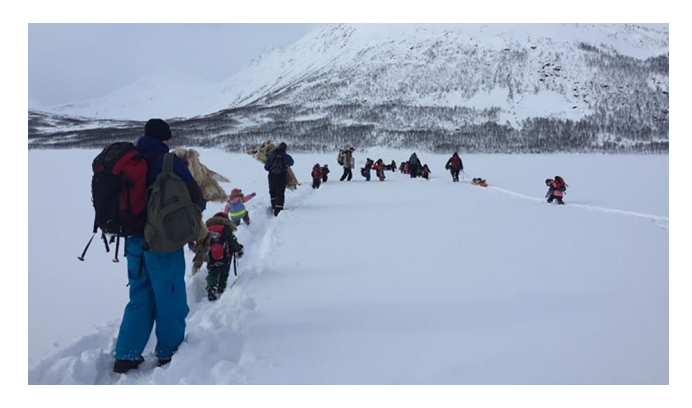
Figure 2. From ice fishing during the month of April.