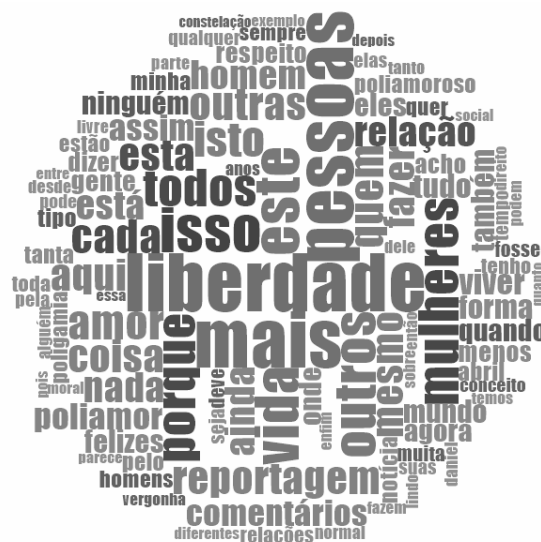
Image 1 – Word cloud derived from the full dataset. Words in Portuguese. Size correlates with word frequency.

In order to analyse the content of our research, we have collected a total of 464 comments on the news piece (431 made in “SIC Notícias” and 33 in “Expresso”). We started off by checking which words were more common in all of the comments taken together, eliminating some more common conjunctions and other non-relevant syntactic elements (e.g.: the Portuguese equivalents of “and”, “but”, “a”). Those results can be seen on Image 1, a word cloud representing the frequency of the words by the size they have. “Freedom” (‘liberdade’) is the single most common word, lending legitimacy to the decision of analysing how this concept is approached in relation to polyamory. “People” (‘pessoas’) and “women” (‘mulheres’) are also near the top, making it important to consider the gendered dimension of those comments, and if or how gender is explicitly mentioned.