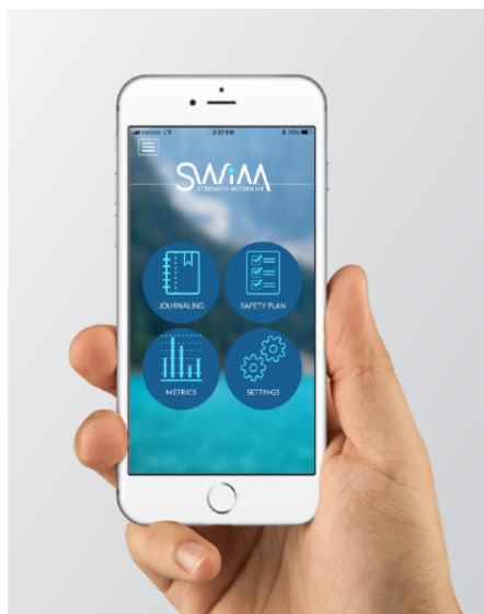
Figure 1. Screenshot to illustrate the front screen of the Strength Within Me app.

In addition, the SWiM app enables service users to create a safety plan using a 3-step process. Step 1 involves self-soothing activities that they can perform on their own; step 2 involves activities they can perform with a friend or caregiver if step 1 does not help; and step 3 involves identifying a professional they can contact, such as their doctor or clinician, if the first 2 steps do not help. Participants can choose from 4 emotions with which they may struggle (sad, angry, lonely, and worried) to create a safety plan. They also have the 'other' option so that they can develop a safety plan for additional emotions. Safety plans can be adjusted to reflect what is working for each participant and what is not (Figure 1).