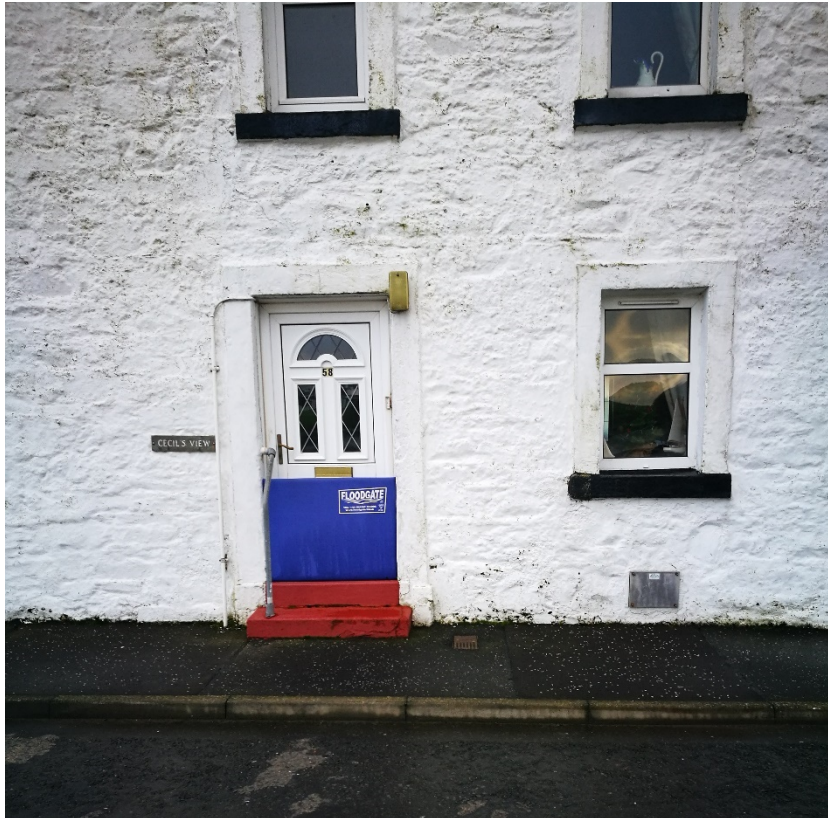
Fig. 1: Example of a PFR resistance measure: a temporary guard in operation with air brick cover. [In colour]

and resilience measures that assume that property will enter a property and seek to minimise damage (e.g. easy-to-replace internal materials).