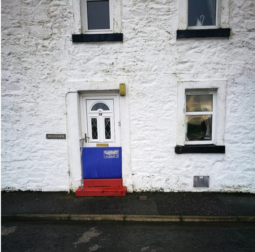
Fig. 1: Example of a PFR resistance measure: a temporary guard in operation with air brick cover. Source: Authors, January 2018. [In colour]

and resilience measures that assume that property will enter a property and seek to minimise damage (e.g. easy-to-replace internal materials).