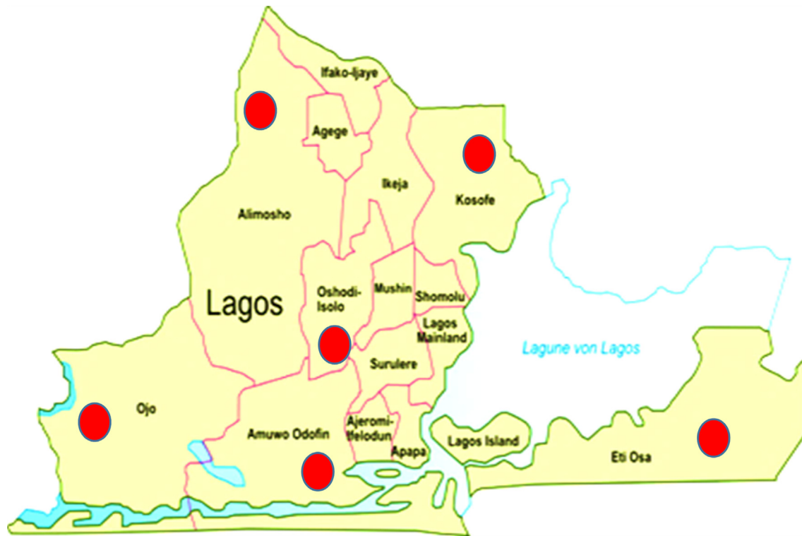
Fig. 1 – An overview of the research sites.