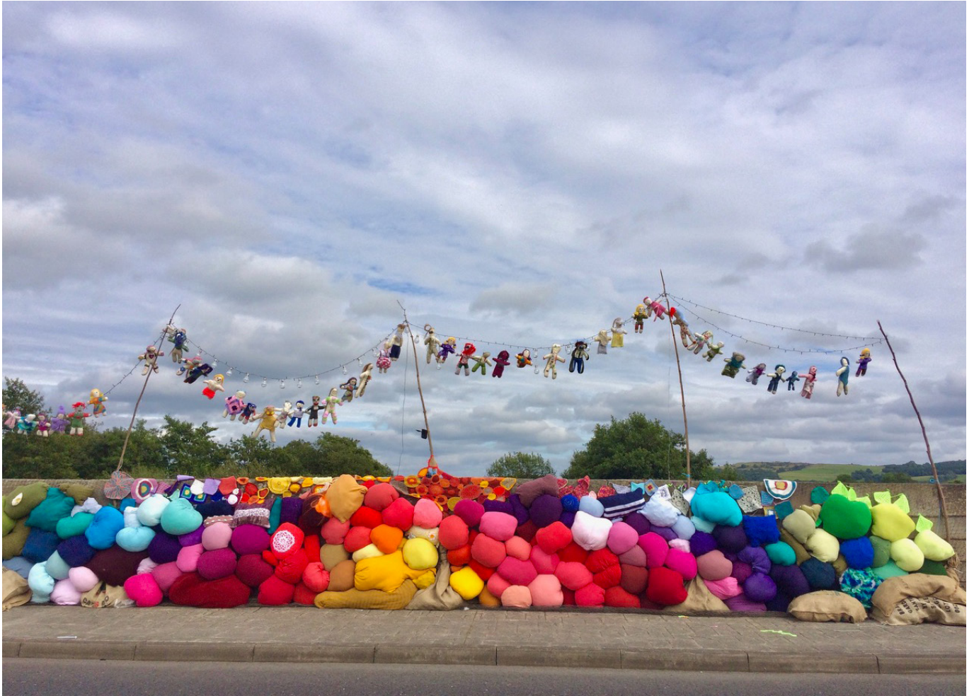
Figure 0.1: Rita Duffy, Soften the Border , 2017. Recycled fabrics, installation on the Belcoo, Blacklion Bridge - Co. Fermanagh / Co. Cavan border, 2.5 x 30m (Copyright of the artist, Rita Duffy.)

appeal of its website (Artists for Brexit, 2018) is in keeping with the prominent role initially played within the group by Munira Mirza, director of the Conservative Government's Number 10 Policy Unit and appointed by Boris Johnson, after her earlier role as London's Deputy Mayor, for Education and Culture. There has, however, been a real diversity of forms of critical engagement with the complexities of Brexit within artistic practice, whether this be street art or photography, collaborative craftivism right on the edge of the United Kingdom, or curatorial interventions right at its heart. Northern Ireland-based artist Rita Duffy's Soften the Border (2017) (Figure 0.1) addresses the very real issues posed by a hard border with the Republic, and which threaten to undermine the legacy of the Good Friday Agreement. For three days between 10 and 13 August Duffy's installation was situated on a bridge that marks the actual boundary between Northern Ireland and the Republic, and which she temporarily covered in soft furnishings knitted, crocheted and sewn by local women's community groups on both sides of the border (Cathcart, 2017). On one level, the installation can be