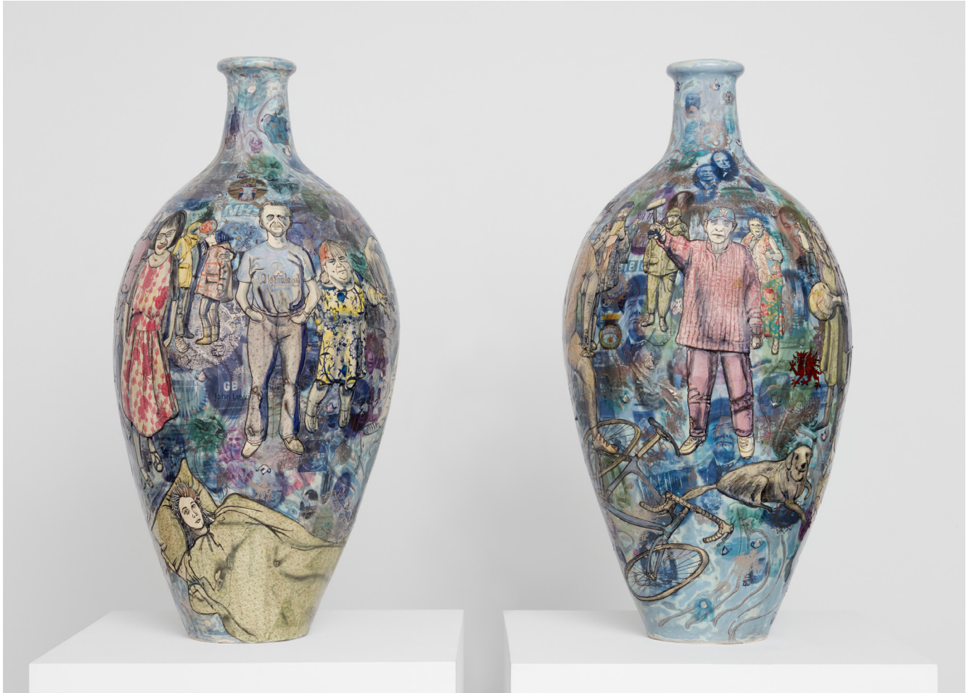
Figure 0.2: Grayson Perry, Matching Pair , 2017. Glazed ceramic, diptych, each: 105 x 51 cm; 41 3/8 x 20 1/8 in (© Grayson Perry, courtesy the artist and Victoria Miro)

politics. This is reinforced however, by a quotation from Gerrard Winstanley, the seventeenth-century reformer and activist leader of the True Diggers, one of the radical groups emerging during the English Civil War, and whose occupation of public lands privatised by enclosures sought to challenge the ownership of property. Winstanley's advocacy of 'Freedom (as) the man who will turn the world upside down' in the contemporary context suggests a world of workers' rights very different to potential post-Brexit scenario of a pernicious disenfranchisement (Winstanley, [1652] 1973).