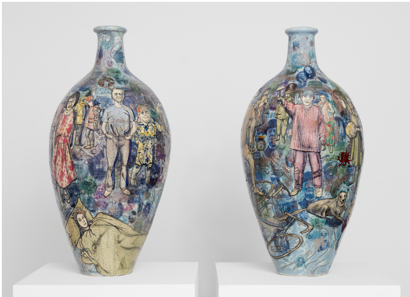
Figure 0.2: Grayson Perry, Matching Pair , 2017. Glazed ceramic, diptych, each: 105 x 51 cm; 41 3/8 x 20 1/8in (© Grayson Perry, courtesy the artist and Victoria Miro)

politics. This is reinforced however, by a quotation from Gerrard Winstanley, the seventeenth-century reformer and activist leader of the True Diggers, one of the radical groups emerging during the English Civil War, and whose occupation of public lands privatised by enclosures sought to challenge the ownership of property. Winstanley's advocacy of 'Freedom (as) the man who will turn the world upside down' in the contemporary context suggests a world of workers' rights very different to potential post-Brexit scenario of a pernicious disenfranchisement (Winstanley, [1652] 1973).