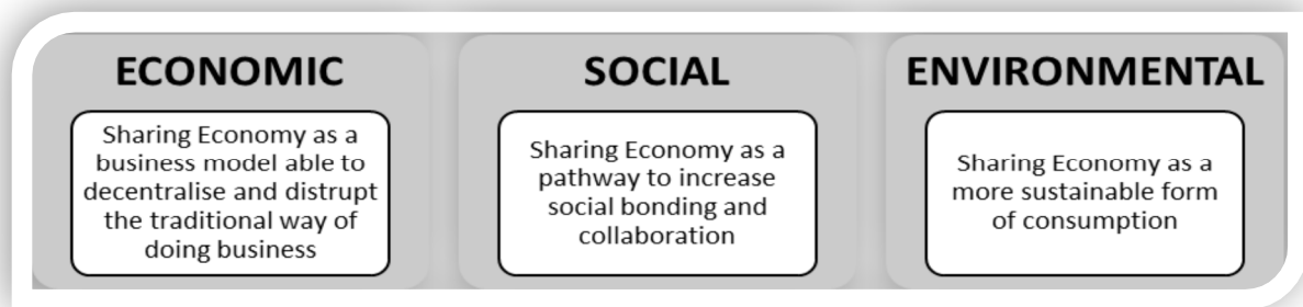
Figure 1. Sustainability dimensions of the framework of sharing economy.

In spite of the publication of papers oriented to investigate how the mechanisms of the sharing economy and the related “socially-progressive feel-good rhetoric” [10] (p.3) have been used by companies to increase profit and market share [3,32], most of the literature still frames the sharing activities as a collaborative consumption model that is able to produce a more sustainable and socially connected economic system [10]. Within this context, Figure 1 summarizes the main frameworks that have been used to define the sharing economy, in line with the three sustainability dimensions.