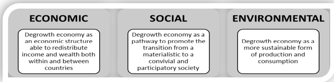
Figure 2. Sustainability dimensions and framework of degrowth.

In Figure 2, the main frameworks that have been used to define degrowth are summarized in line with the three sustainability dimensions previously used for the sharing economy.