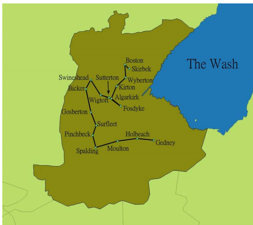
Figure One: Map of the Route of the Inquiry, 1196.