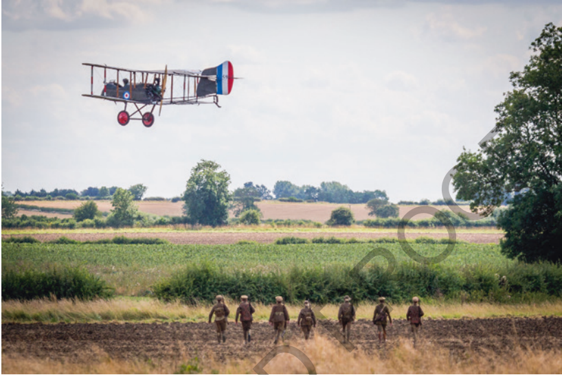
Fig. 2.2 The ‘Beechey Boys’ leave for war. Leaving Home (2014)

(commemorate) the dead fallen in battle), almost nothing of Leaving Home was concerned with the moment(s) of conflict that the eight Beechey brothers might have experienced during their wartime service. In the penultimate sequences of both the Friesthorpe and Arboretum versions of Leaving Home , we see the eight brothers ‘leave home’ for the war.