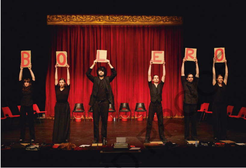
Fig. 5.1 Performers raise small signs spelling ‘Bolero’, reminiscent of figure skating score-cards. In performance at Nottingham European Arts and Theatre (neat) festival ( Bolero [2014])

music and war. It was devised with an international cast and toured to Bosnia & Herzegovina and Kosovo after its premiere at Nottingham Playhouse as part of neat14 1 in May 2014. It was performed in Sarajevo on 28 June: the centenary of the assassination of Franz Ferdinand. The performance features that assassination and follows the ricochet of the gunshot that triggered the First World War through 100 years of history, to the 1984 Winter Olympics to the Bosnian War to the present day. I sought to shine a light on the tragedy that consumed Sarajevo in the 1990s and I invited Bosnian actors, who lived through the war, to share their experiences as part of the process. The cast included a German actor, two British actors, three Bosnian actors and 20 local community performers from the East Midlands region who represented the company in the original ballet of Bolero (1928), commissioned for L’Opera Garnier by prima ballerina, Ida Rubinstein.