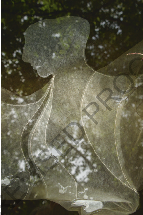
Fig. 13.2 Alarch: Torso by Clare Parry-Jones

Within these chambers, rituals would have occurred countless times. Creating a modern ritual in an ancient site led me to appreciate the designs of these sacred sites, in terms of their relationship to ritual, their positioning in relation to the surrounding landscape and their psychological impact upon the soul and body. The design of the narrow, darkening passage creates a threshold between the outer physical world and the inner psychic worlds. The round, womb-like chamber provides a holding space, sheltered, grounded and calm, supporting the main part