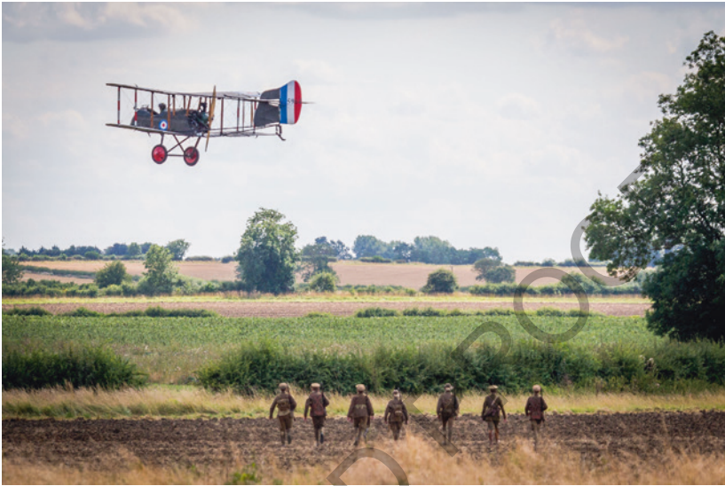
Fig. 2.2 The ‘Beechey Boys’ leave for war. Leaving Home (2014)

(commemorate) the dead fallen in battle), almost nothing of Leaving Home was concerned with the moment(s) of conflict that the eight Beechey brothers might have experienced during their wartime service. In the penultimate sequences of both the Friesthorpe and Arboretum versions of Leaving Home , we see the eight brothers ‘leave home’ for the war.