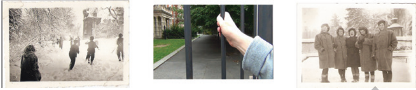
Fig. 3.1