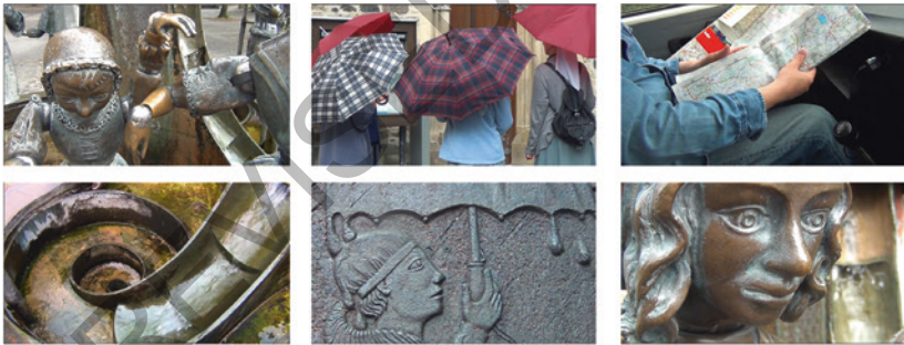
Fig. 3.5

After that we more or less joined on the end of the parade so that we'd get through the gates without having to push through the crowd, and when they were all lined up outside we took another snap. We then came back to the office where I'm now typing this.