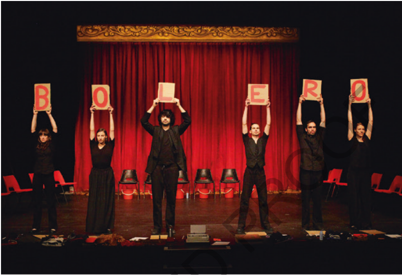
Fig. 5.1 Performers raise small signs spelling ‘Bolero’, reminiscent of figure skating score-cards. In performance at Nottingham European Arts and Theatre (neat) festival ( Bolero [2014])

music and war. It was devised with an international cast and toured to Bosnia & Herzegovina and Kosovo after its premiere at Nottingham Playhouse as part of neat14 1 in May 2014. It was performed in Sarajevo on 28 June: the centenary of the assassination of Franz Ferdinand. The performance features that assassination and follows the ricochet of the gunshot that triggered the First World War through 100 years of history, to the 1984 Winter Olympics to the Bosnian War to the present day. I sought to shine a light on the tragedy that consumed Sarajevo in the 1990s and I invited Bosnian actors, who lived through the war, to share their experiences as part of the process. The cast included a German actor, two British actors, three Bosnian actors and 20 local community performers from the East Midlands region who represented the company in the original ballet of Bolero (1928), commissioned for L’Opera Garnier by prima ballerina, Ida Rubinstein.