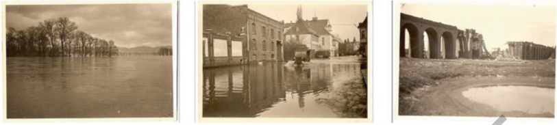
Fig. 3.3