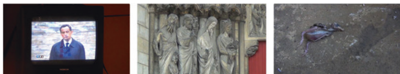
Fig. 3.2