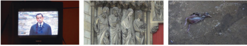
Fig. 3.2