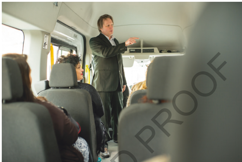
Fig. 8.2 Third Angel's Cape Wrath in performance at WROUGHT Festival, Sheffield (2016)

Writing this now, six years later, I realise that of course my grandad did not need to exaggerate to make himself more interesting. But having now read his incredibly detailed diary of the journey, and having now told this simple travelogue many times, I realise that what he understood was the value of a couple of tweaks and a bit of editing in the service of good storytelling. After all, that is the version I remembered (Fig. 8.2).