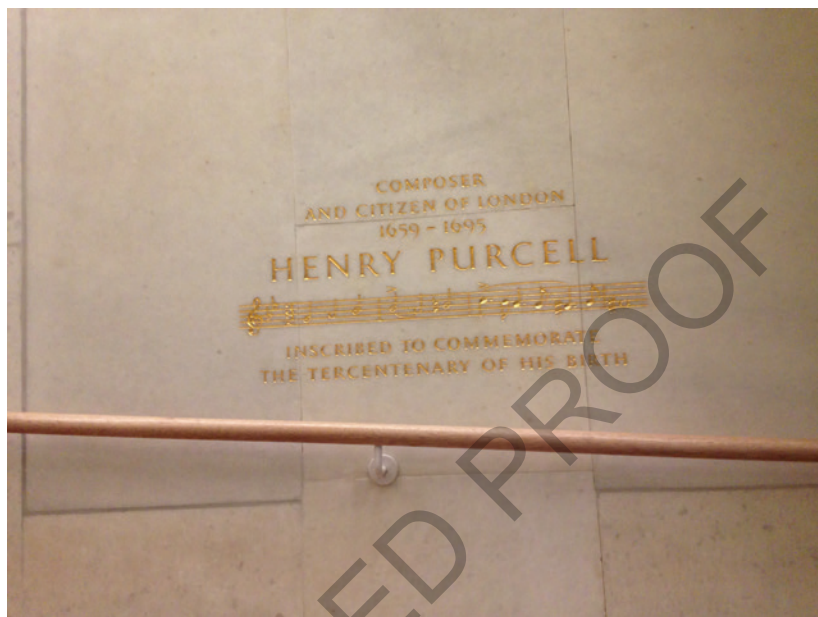
Fig. 15.1 Inscription dedicated to Henry Purcell at the Queen Elizabeth Hall, London. The music pictured is a fragment of Dido's Lament: When I Am Laid in Earth from Dido & Aeneas (1689)