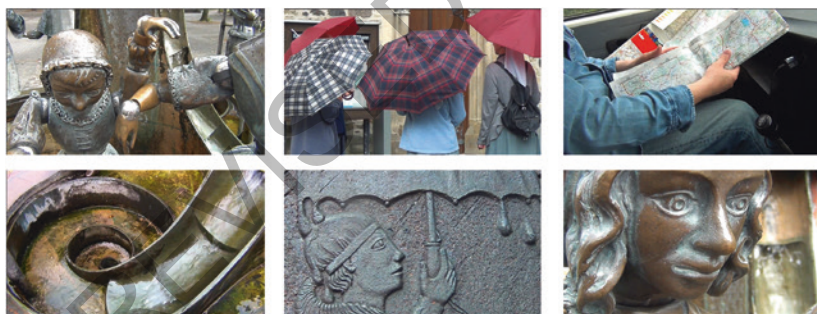
Fig. 3.5

After that we more or less joined on the end of the parade so that we'd get through the gates without having to push through the crowd, and when they were all lined up outside we took another snap. We then came back to the office where I'm now typing this.