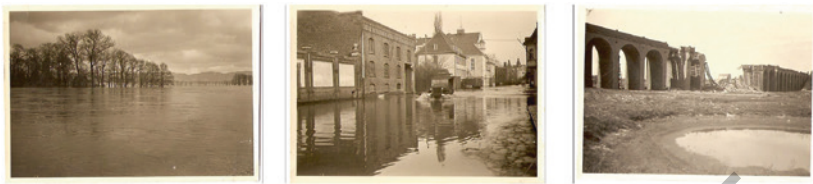
Fig. 3.3