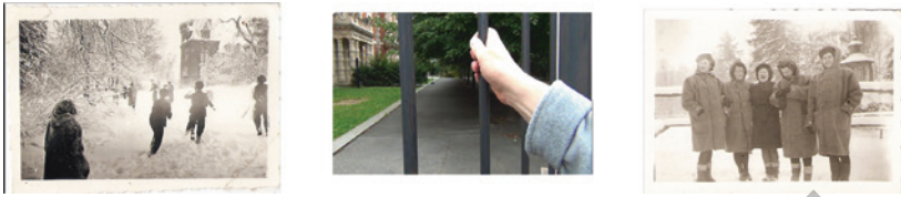
Fig. 3.1