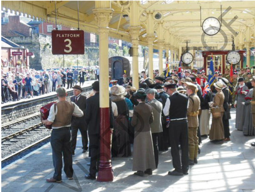
Fig. 4.1 Performers and audience encounter one another across platforms in Over By Christmas (2014)

... the complex superimposition and co-existence of a number of narratives and architectures, historical and contemporary. These fall into two groups: those that pre-exist the work—of the host—and those which are of the work—of the ghost. (Pearson 1997, p. 96)