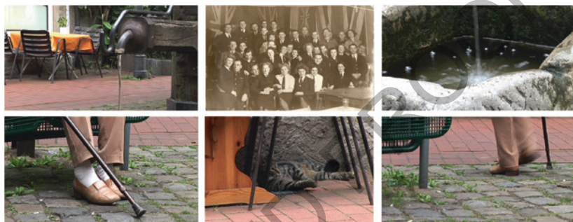
Fig. 3.6 (©2018, Karen Savage and Justin Smith)

The Sacre Coeur (remember, the church on top of Montmartre?) also is floodlit and as you leave Paris by train you can see it standing out bathed in light from the top of the hill – it's lovely. I wish I could photograph them for you and let you see how wonderful they look. We didn't stay late last night because we all felt still tired from the journey, but soon I am going to stay in till the late train to see all the illuminations.