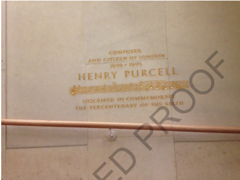
Fig. 15.1 Inscription dedicated to Henry Purcell at the Queen Elizabeth Hall, London. The music pictured is a fragment of Dido's Lament: When I Am Laid in Earth from Dido & Aeneas (1689)