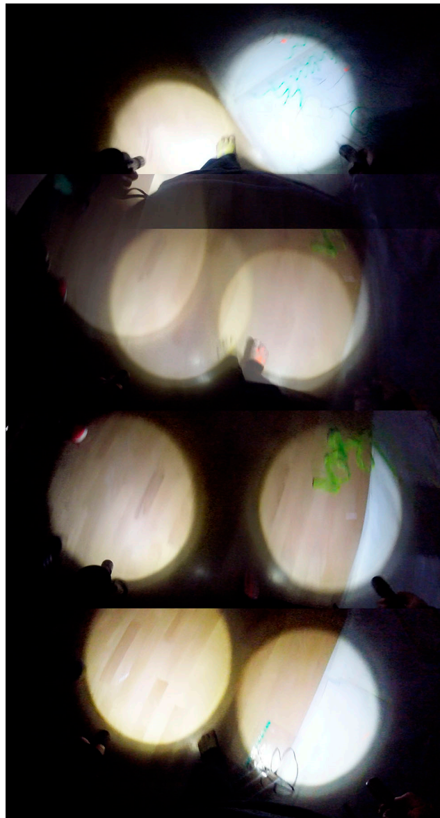
Figure 4. Light and shadows: A six year old boy walks holding two torches, one in each hand, around the perimeter of the paper. As the projected circles separate, join, merge, the painted feet step in and out of their projected circles. Now the fluorescent paint on the skin glimmers, now it disappears.

The ethics of these ethico-aesthetics is immanent, its aim is to seek modes of collective life that intersect and create with the latent, virtual and differential forces of the world as ways of enhancing oneself and one's milieu (Rolnik 2017). Therefore, bringing ethico-aesthetics to material play fosters a view of the parental subject not as one who supervises, supports, scaffolds children's play while remaining outside the event. It conceives parents as participating bodies traversed by forces affected by the immediacy, emergence, process and unexpectedness of the play, as bodies joining in the midst of activity in continuous variation. By focusing on the material forces of play and their sensuous forms of contagion and affect, we situate the attention in parenting as an experimental togetherness (Stengers 2005) that encounters new existential relations open-endedly, with curiosity, to pose new questions.