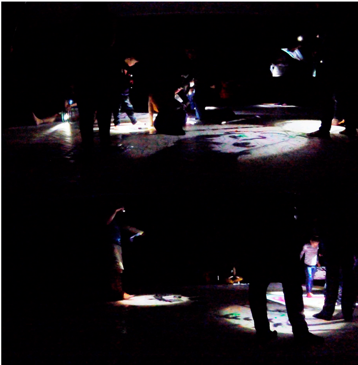
Figure 5. Projected marks: Collective movements with torches and projections.