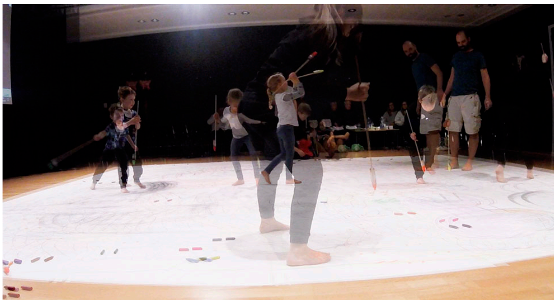
Figure 3. Collective mark-making #2: Group of children and one adult playing with the markers-on-the-stick. Play relations are not based on filiation but on transversal connections.