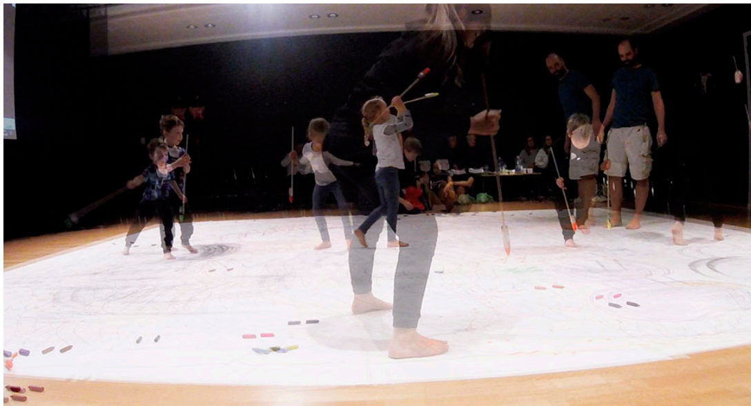
Figure 3. Collective mark-making #2: Group of children and one adult playing with the markers-on-the-stick. Play relations are not based on filiation but on transversal connections.