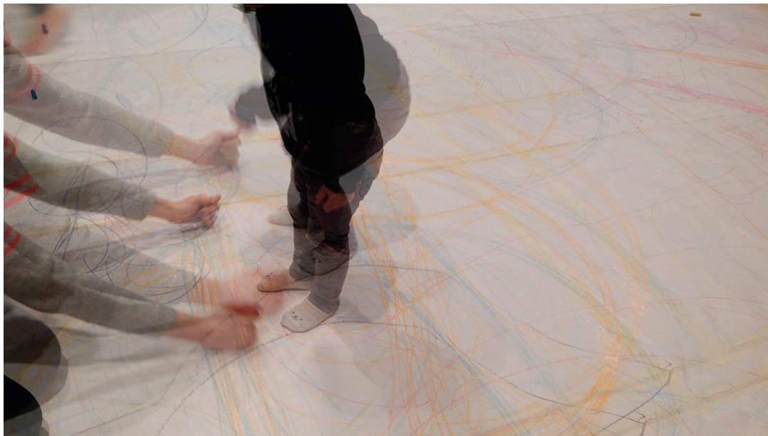
Figure 2. Collective mark-making #1: mother marking around the body of her three year old daughter, as in turn her daughter retraces marks with her feet and body, skipping and squatting.