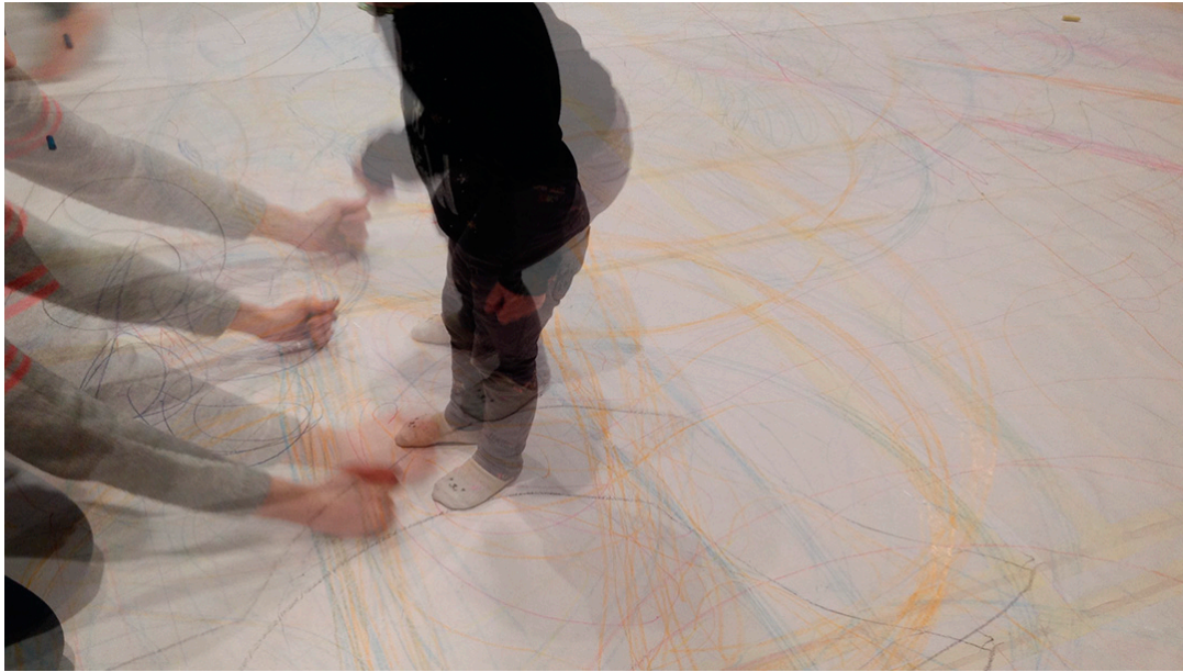
Figure 2. Collective mark-making #1: mother marking around the body of her three year old daughter, as in turn her daughter retraces marks with her feet and body, skipping and squatting.