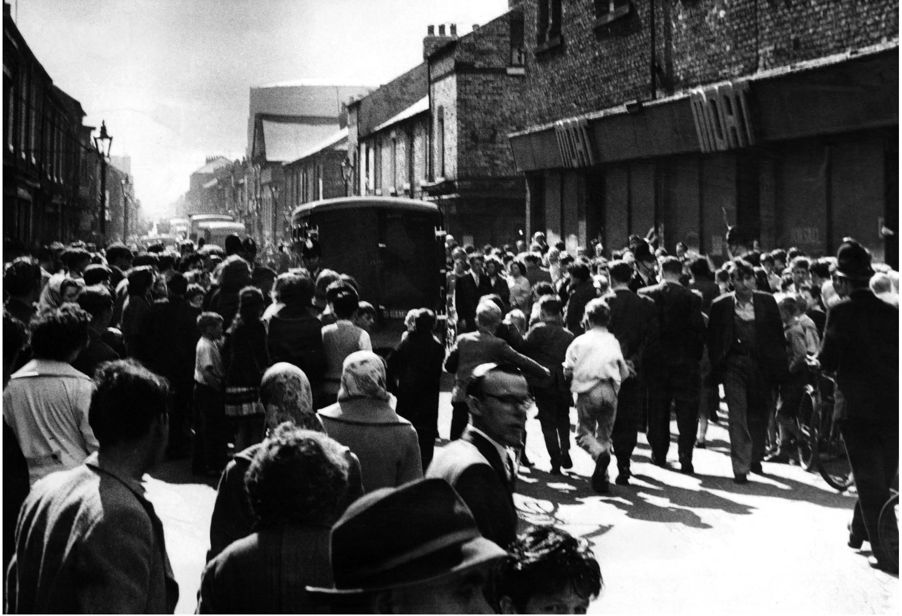
Crowds gather during the Cannon Street Riots