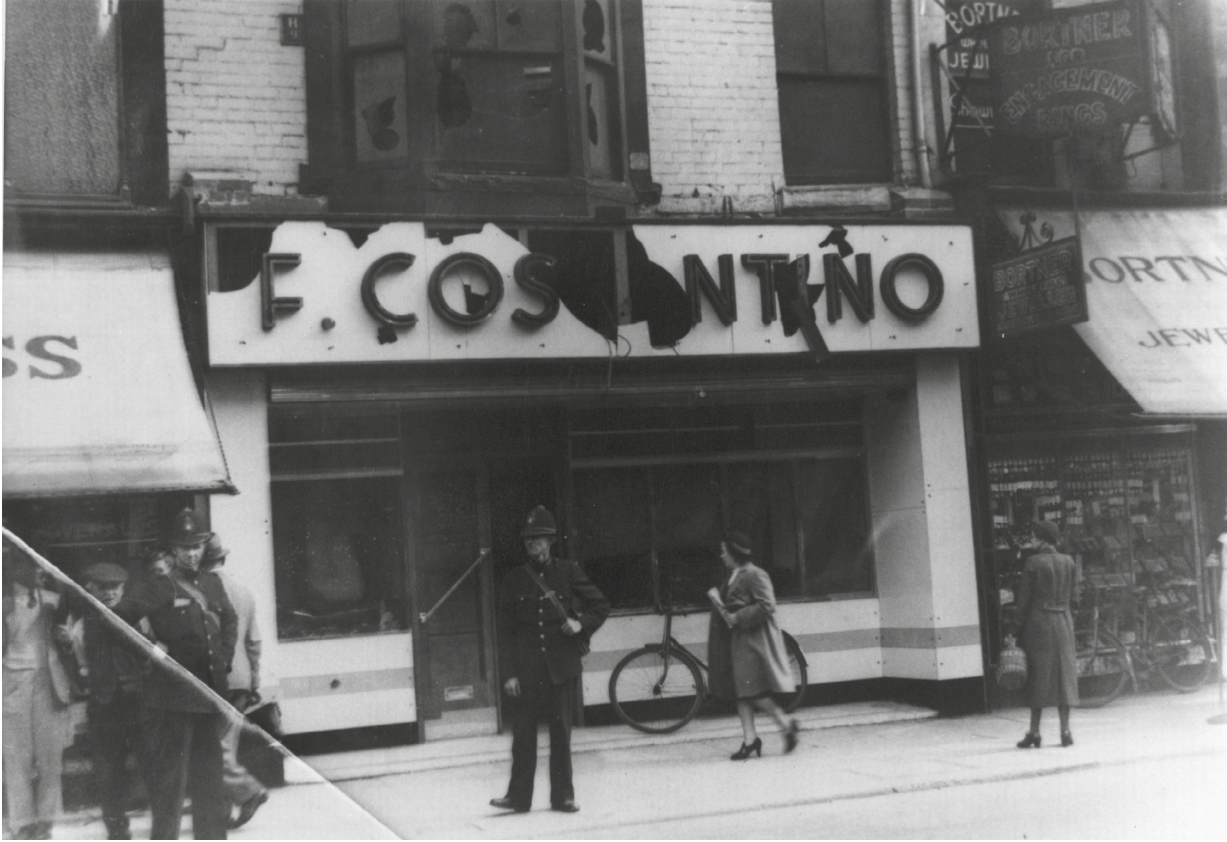
Constantino's Ice Cream Parlour on Newport Road following Anti-Italian Disturbances after Italy declared war against the Allies, 10th June 1940