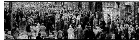
Crowds in the riot street yesterday after the battle with police.