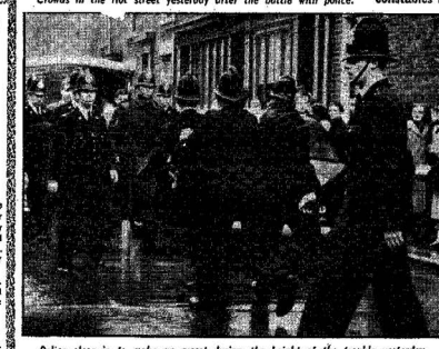
Police close in to make an arrest during the height of the trouble yesterday.