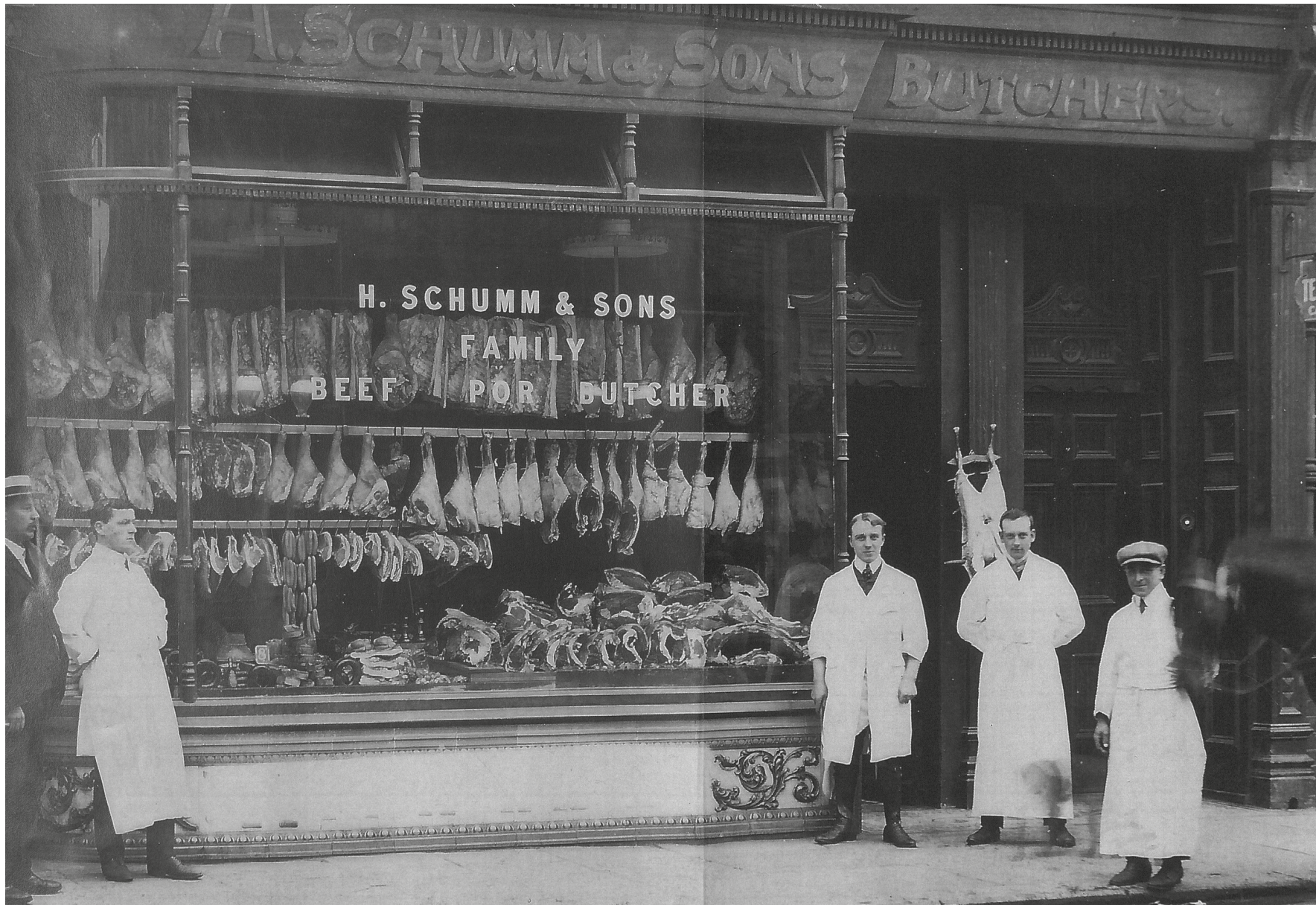
Henry Schumm & Sons Butchers on Newport Road in 1911 before the extensive damage caused by anti-German attacks in 1914