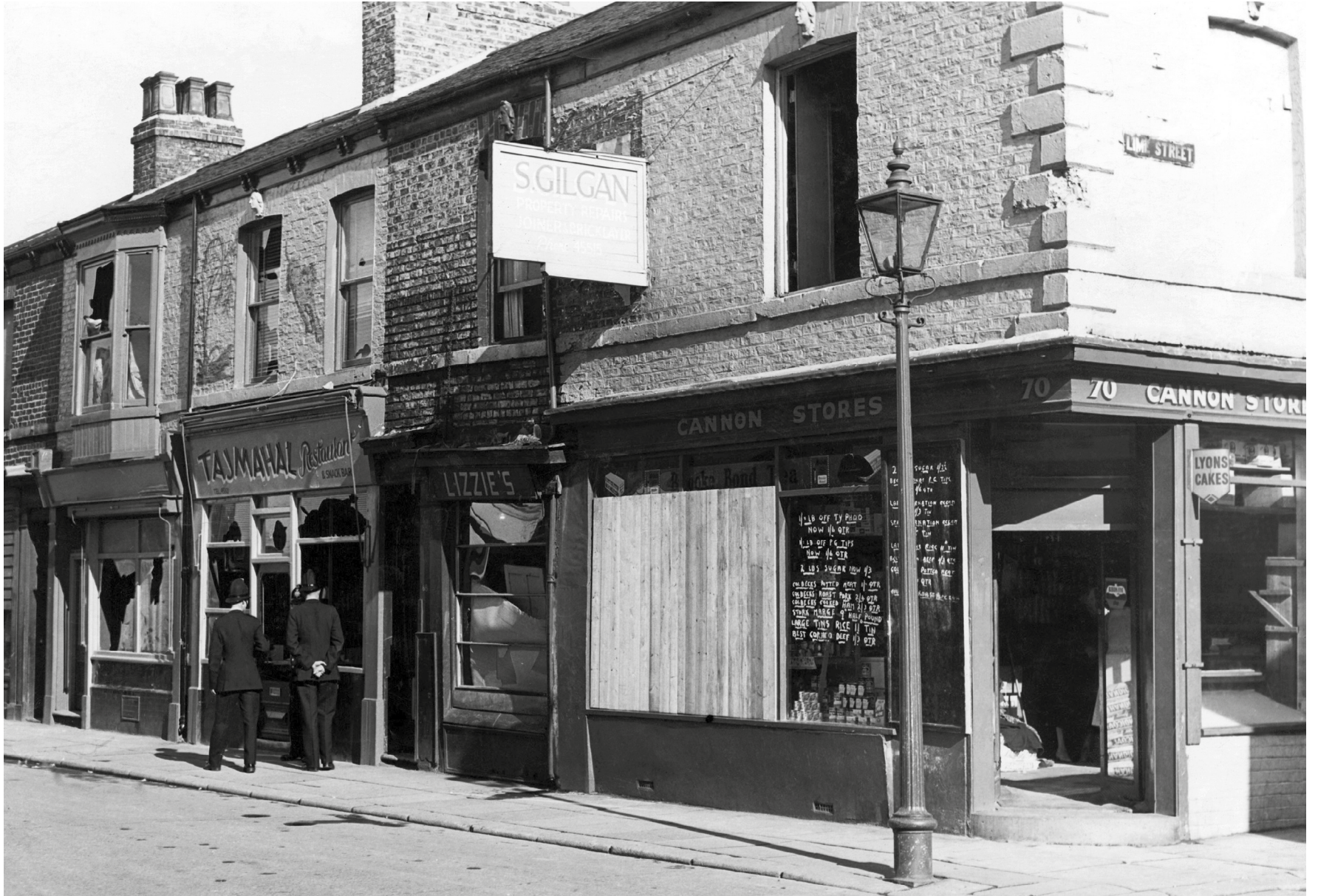
The damaged Taj Mahal is inspected by police