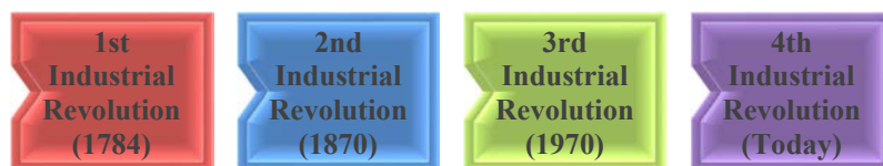
Figure 1: Industrial revolution [5].

According to [11], Internet of Things (IoT) or Cloud Computing technologies are terms stand for Revolution 4.0. Definition of fourth industrial revolution can be different as