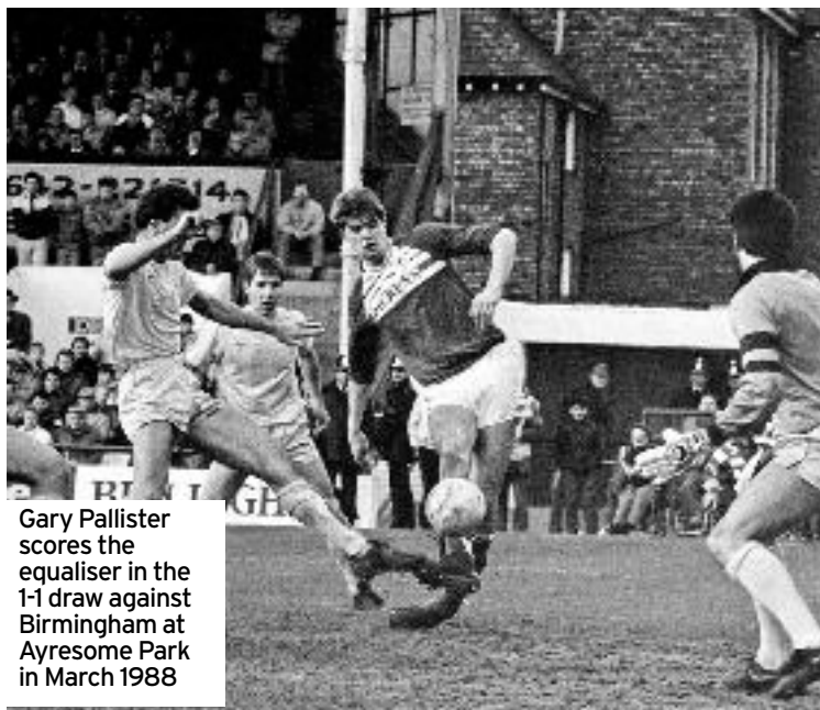
Gary Pallister scores the equaliser in the 1-1 draw against Birmingham at Ayresome Park in March 1988