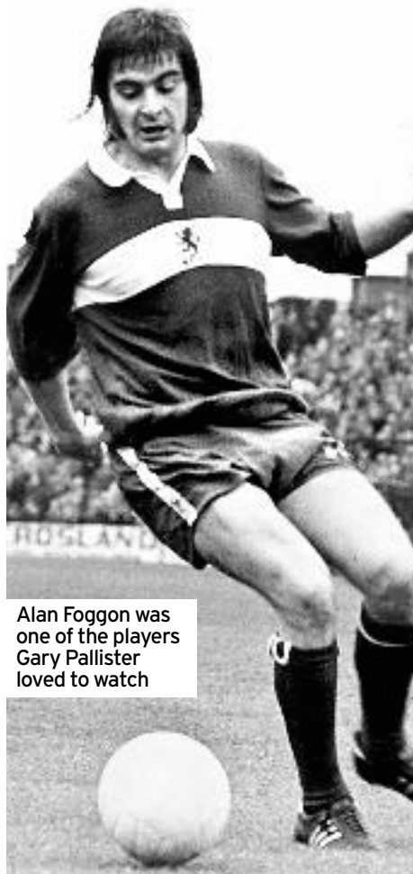
Alan Foggon was one of the players Gary Pallister loved to watch

"The old stadiums were great to play in because you felt the atmosphere and tradition and you felt as though you were a part of that. You lose a little bit of that when you go to new stadiums but obviously football has got to move on. After what happened at Hillsborough you have got to make football sta-