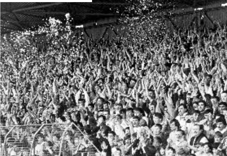
Ayresome Park erupts after Boro gain promotion to the second division after their 0-0 draw with Wigan

"Probably at that time I was probably still getting a little bit of stick off the Boro faithful for leaving in 1989. It was always difficult for me, it did play on my mind when I played against Middlesbrough and I don't know whether other players had that kind of feeling but it was never a comfortable experience for me that's for sure."