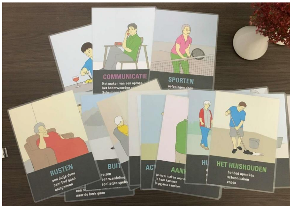
Figure 1: MinD Visual Cards, developed to support interviews with people with dementia.

They proved to be especially supportive as conversation starters in situations where participants did not directly know what to answer. Additionally, as a physical reminder, they helped the interviewers to cover all of the interview topics in the semi-structured interviews.