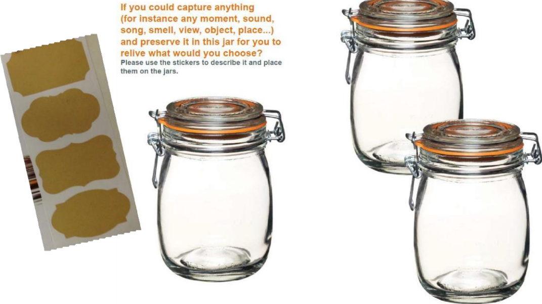
Figure 2: 'Do books' exercise about preserving important moments in people's lives.

15 do books were distributed over three countries, Germany, the Netherlands and Spain. They remained the property of the participants but anonymized pictures were taken of the results for analysis. First results promise valuable insights into decision making and attitudes with respect to future plans of people with dementia.