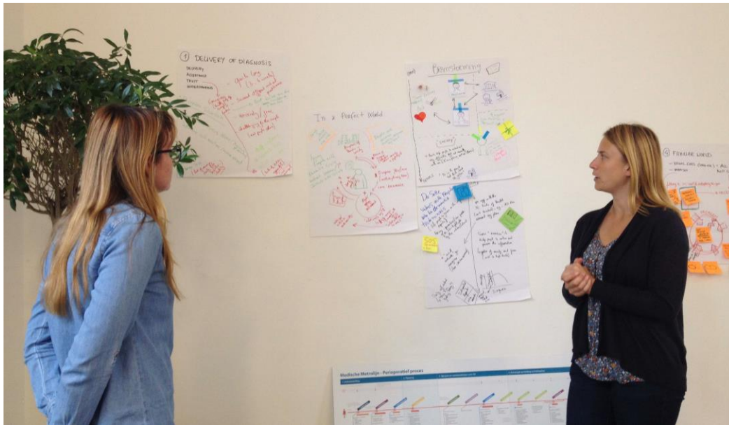
Figure 4: Sharing and discussing brainstorming ideas.

The second step is to define the goals of the creative session and sharing the relevant insights from research and data collection. In the first MinD design workshop, the insights used were four major issues in the context of dementia: a) delivering the diagnosis, b) acceptance (internal and external), c) changing relationship and d) living in a familiar world. In small teams of two participants each of these four issues were explored further by sharing knowledge. Conclusions were noted and shared.