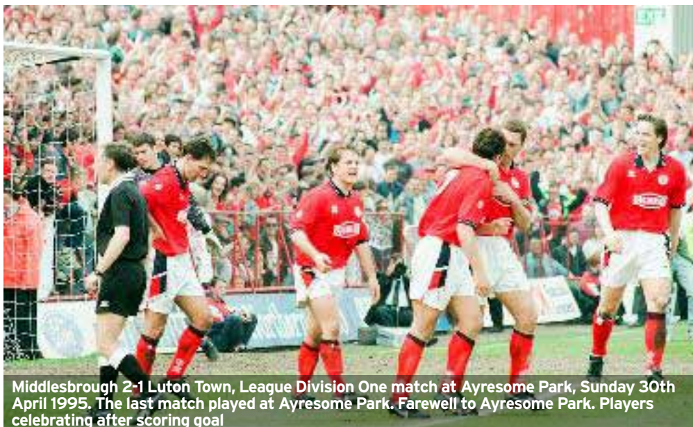
Middlesbrough 2-1 Luton Town, League Division One match at Ayresome Park, Sunday 30th April 1995. The last match played at Ayresome Park. Farewell to Ayresome Park. Players celebrating after scoring goal