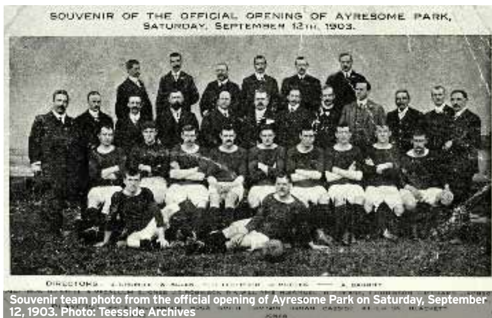
Souvenir team photo from the official opening of Ayresome Park on Saturday, September 12, 1903.