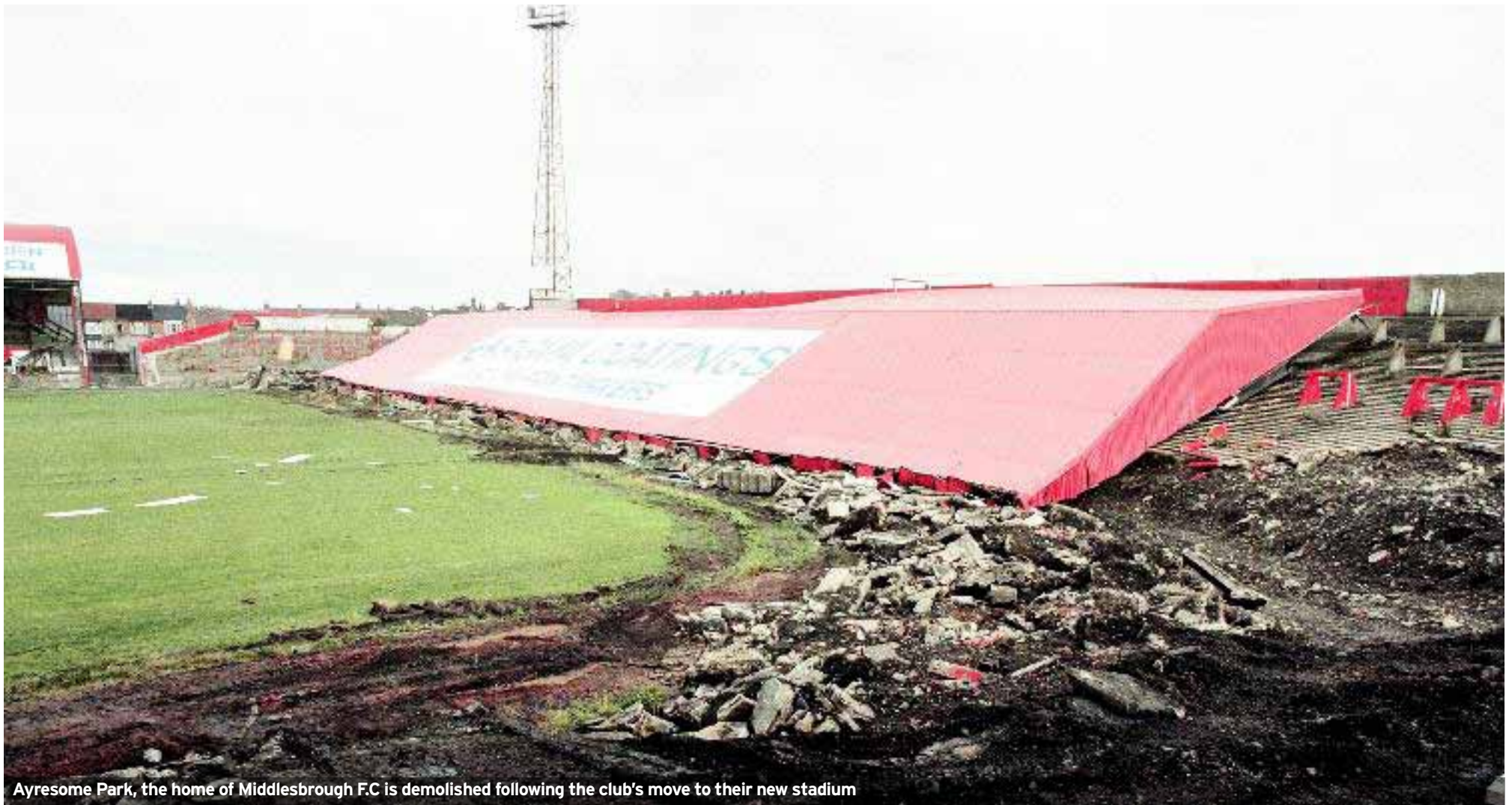
Ayresome Park, the home of Middlesbrough F.C is demolished following the club's move to their new stadium

wait till 10 minutes before time when they used to open the gates, and see the last 10 minutes of the match.