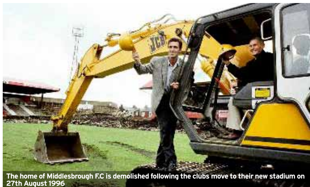
The home of Middlesbrough F.C. is demolished following the club's move to their new stadium on 27th August 1996