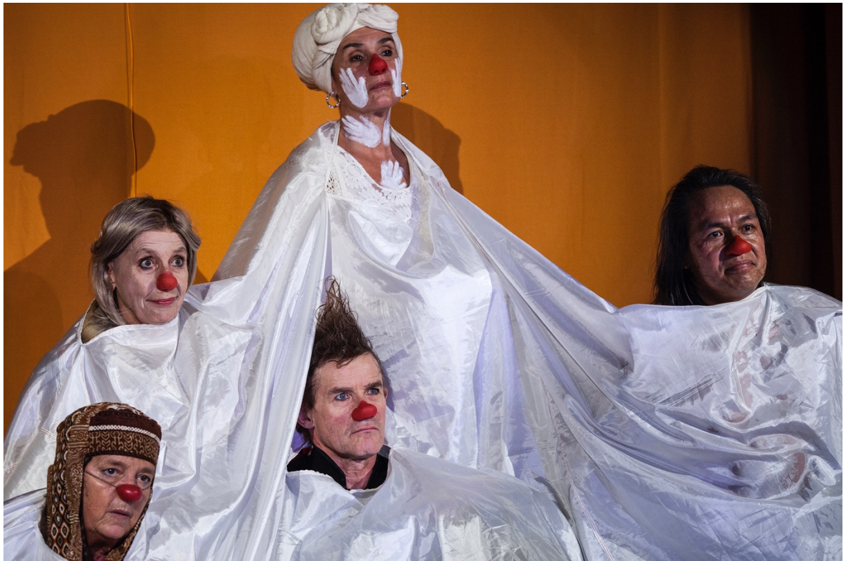
Odin Teatret Archives - Performance: "The Tree" - Director: Eugenio Barba - Photo: Francesco Galli

The Tree is not groundbreaking efficaciously – it is unwieldy at times, defeatist almost, demonstrating how easy it is for all of us to turn our backs on the inequality of the world. Our attention is as fluttering as the birds fluttering through the sky; we all busy ourselves with daily tasks that we rationalize as being important. In a similar fashion, the actors are having to do busy work in the space, building trees and faffing about with cloths to ultimately no effect, as the tree is chopped down and remains barren. The political message of the piece lies in the interstices of all of this, in the fissures between the performance, its programme and the personal associations that they all evoke in us.