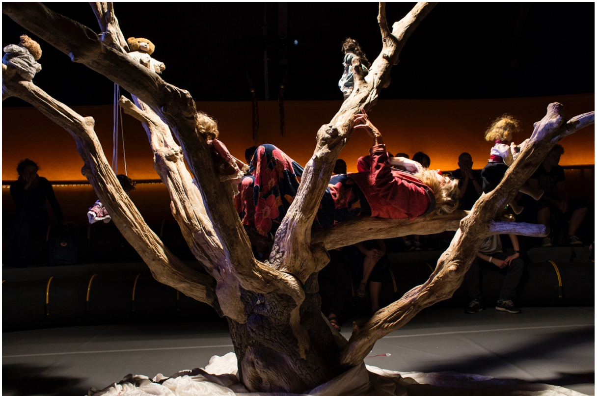
Odin Teatret Archives - Performance: "The Tree" - Director: Eugenio Barba - Photo: Francesco Galli

Ostensibly, the narrative conceit of The Tree seems deceptively simple, slight almost; disparate characters gather around an apparently barren tree, seeking ways to bring the birds back. According to the performance programme, Yazidi monks rub shoulders with a European and an African Warlord, an Igbo woman from Nigeria, a Poet's daughter and her younger alter-ego, two Storytellers and a Deus ex Machina. This is not untypical of Odin's work, which often gathers seemingly unrelated, often allegorical characters together in scenic space. The ensuing dramaturgy is always much more complex than the initial premise might suggest.