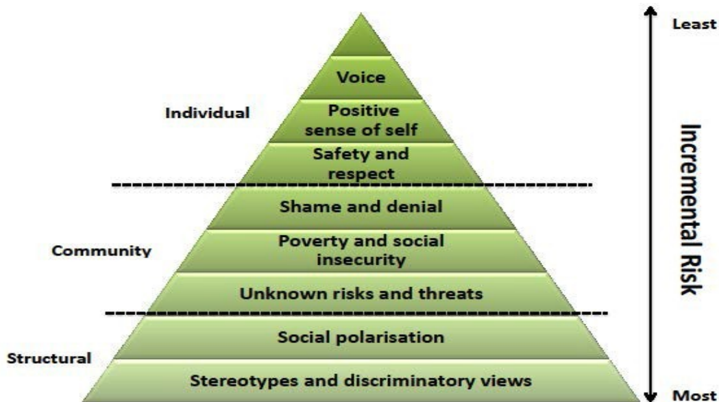
Figure 2 Allen (2015) Incremental scale of added vulnerabilities when assessing risk of CSE.

Understanding the dynamic nature of added vulnerabilities in the assessment of risk should form part of any education plan. In particular, the risk of what is unknown can be difficult to legislate for. However, this can be assisted by maintaining good community relations and reliance on the observations of the public and practitioners of all services. Further areas for prevention are detailed in Figure 2.