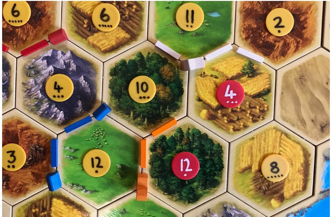
Figure 4. Double-sided production tokens. Production tokens are turned over when crises are triggered.

follow, and to pay a Green Tax, all require collective agreement from those who stand to benefit or lose by such an action. Similarly, and perhaps most significantly, the final change made to the rules of the game is to task players with determining the game's win condition. Before the game begins, players must decide on the outcome should GHGs reach unsustainable levels (13 on the tracker): "Everyone loses. Catan is uninhabitable" or "The player with the highest score wins." This decision, a twist on Oil Spring's "pyrrhic victory", has a profound effect on strategies that are adopted in the game's later stages, but more crucially works to introduce a process of collaborative game design intended to stimulate conversation about collective responsibility. In these ways the game requires players to consider the impact of individual actions and the effects these have on other players and the current game (world) state.