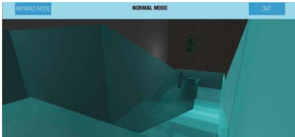
Figure 1: Screenshot of the PS simulator in normal mode

In order to simulate the effects of partial-sightedness, imperfections such as limiting the field of view , altering perception of depth and simulating fatigue were programmed into the PS simulator.