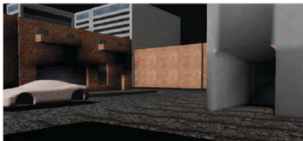
Figure 2: Simulator in progress, playing in normal mode

The horizontal field-of-view for normal sighted individuals is approximately 180-190° with 120° of overlapping area and 30° to 35° of monocular vision on each side of the eye [16]. The loss of sight from one eye would reduce the field of view by approximately 22% - 26%. To simulate the effect of the sight loss in the PS simulator, an opaque black filter was programmed on the left side of the user's display to reduce approximately 25% of the visual in the simulator (See Figure 3).