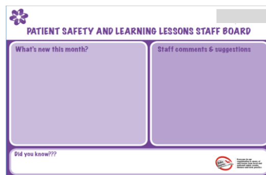
Figure 1. A picture of the safety board used in the current study.

Verbal Reports. Verbal reports are another formal dissemination system that ward managers can use to tell their nurses about adverse safety incidents, typically at regularly scheduled meetings. By taking the time to talk about safety incidents ward managers imply that the information is valuable. Additionally, ward managers who allow their nurses to ask