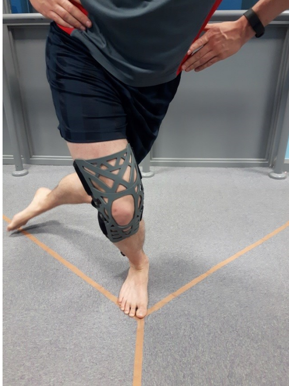
Figure 2. Participant performing the posterolateral reach of Star Excursion Balance Test (SEBT) under the Reaction Brace condition (right leg standing).