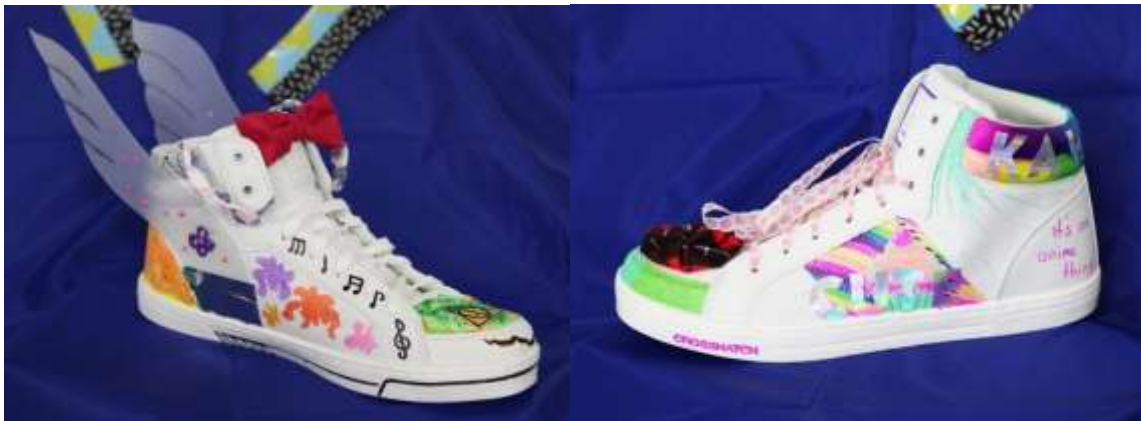
Figure 2. Self-Portrait as a Shoe, 2016.