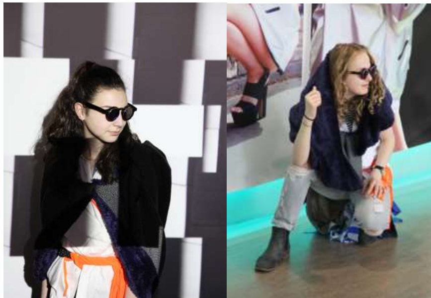
Figure 1. Styling Workshop, 2016.

We decided early on to collect data regarding members educational choices, alongside weekly feedback from the club members, in order to evaluate the impact of the club as it developed. The value of this data as a conduit for research quickly became apparent as we started to see how transformational these sessions were. We had initially set ourselves two key aims; to evaluate the impact of early exposure to the university experience and the study of fashion, and to document the developing aspirations and experiences of potential fashion students in this age range. As the weeks progressed we noticed a new confidence emerging in the club members, as they started exploring the design and make process, and generating ideas for styling and promotion (Fig. 1), they also started to experiment more with their own dress. Responses to the weekly feedback question ‘what did we learn/improve this week?’ moved away from purely skills based responses to more personal statements that suggested a turn in the club experience towards the impact fashion 2 , or dress 3 , has on identity. Participants articulated what they had learnt as ‘To be yourself and not care what others think’, ‘To express myself and be bold’ and ‘How being individual helps to develop ideas’. This prompted us to consider a third aim, on which we focus in this paper; to evaluate the role the club plays in the members exploration of identity and personal style.