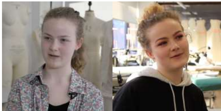
Figure 5. Participant 1, 2016 and 2018.

However, some participants considered their personal style to be more consistent, suggesting that for some the club had less impact on choice of dress. Participant 1 described her style and approach to dressing as unchanged but alluded to a shift in her access to different forms of dress with which to experiment. Between the ages of 13 and 16 the tools available to support one's 'Identity Kit', such as make-up or a wider choice of clothes, become more accessible, which is an important consideration when drawing conclusions about dress and identity in this age range.