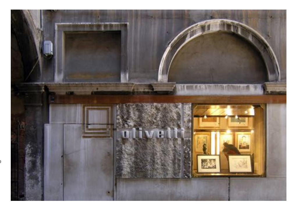
Figure 1.1 Olivetti Shop, Venice by Carlo Scarpa; a beautiful exploration of materials, form and context.

and any changes that are made to that building will have an effect upon the nature of the surrounding location. So for example, a simple shift in the position of the entrance can cause a dramatic change within the order of the urban surroundings. The architect and interior designer will need to be aware of the consequences of such moves and be prepared to act accordingly. Experimental creative arts practices have a role in shaping urban development practices. Artists who work directly with the existing environment can suggest methods of approach. The attitude of the installation artist – someone who is unencumbered by such factors as programme, drains and environmental contro - might be to experiment with ideas that are too radical. inconvenient or costly for the designer. But these can act as precedents, exemplars or provide inspiration for the designer.