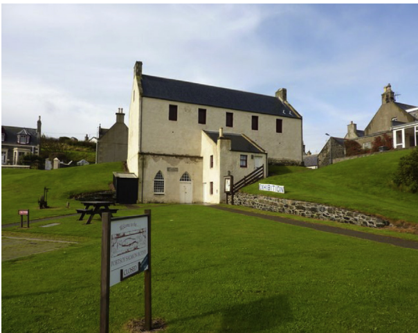
Fig. 4. Portsoy Salmon Bothy.

the Traditional Boat Festival and continues to thrive due to the role volunteers' play in sustaining it as a community enterprise: