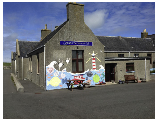
Fig. 1. CE Nis (Ness), Lewis.

Portsoy is a small fishing town that has a harbour that dates to the late seventeenth century. The Portsoy Salmon Bothy developed from the success of the community organised Scottish Traditional Boat Festival (see Fig. 3), which began in 1993 to celebrate the harbour's tercentenary. The hosting of the festival, which originally had its focus upon small Scottish traditional sailing boats, was initially highly successful, and so became a yearly event that grew in popularity due to community and volunteer efforts. The festival developed to integrate other cultural aspects into its remit as it grew, including music, food and craft. This success led to the development of the Salmon Bothy. Once an ice house (Fig. 4) for the Salmon fishing industry (that ended in 1993), it was refurbished and re-opened in 2011 due to volunteers securing funding for its restoration. The Bothy is a museum, community space and office for