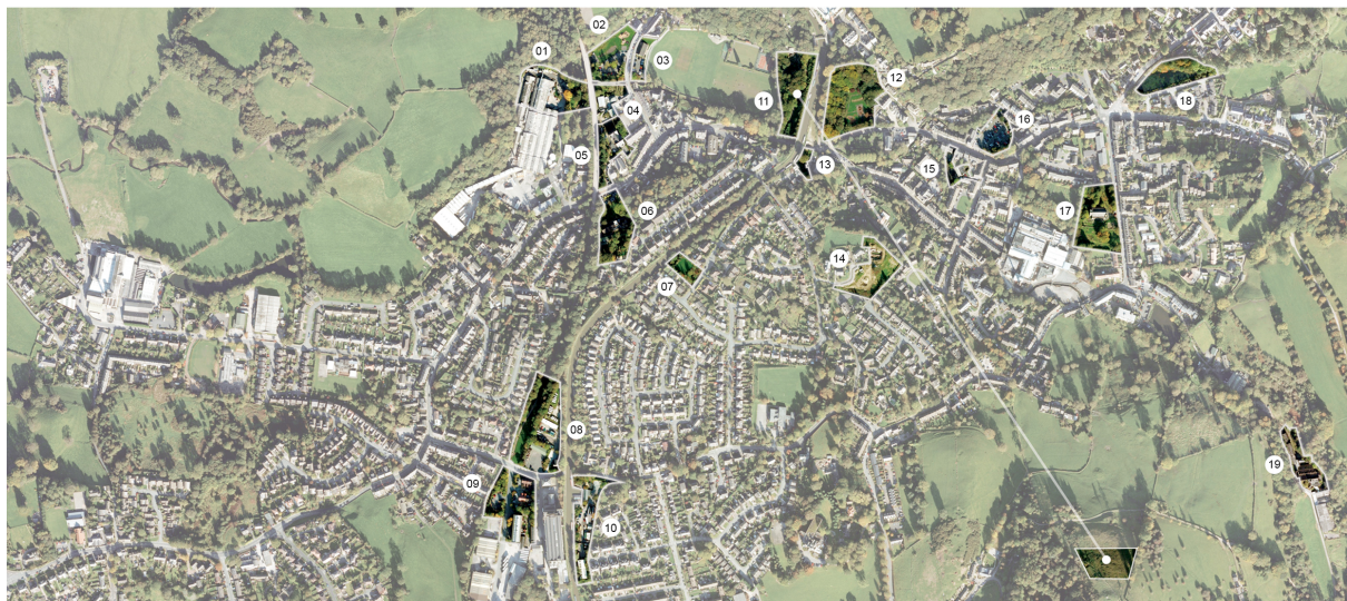
Figure 3. The Rules of Play and Sites of Bollington, Continuity in Architecture and Think Place, 2016.