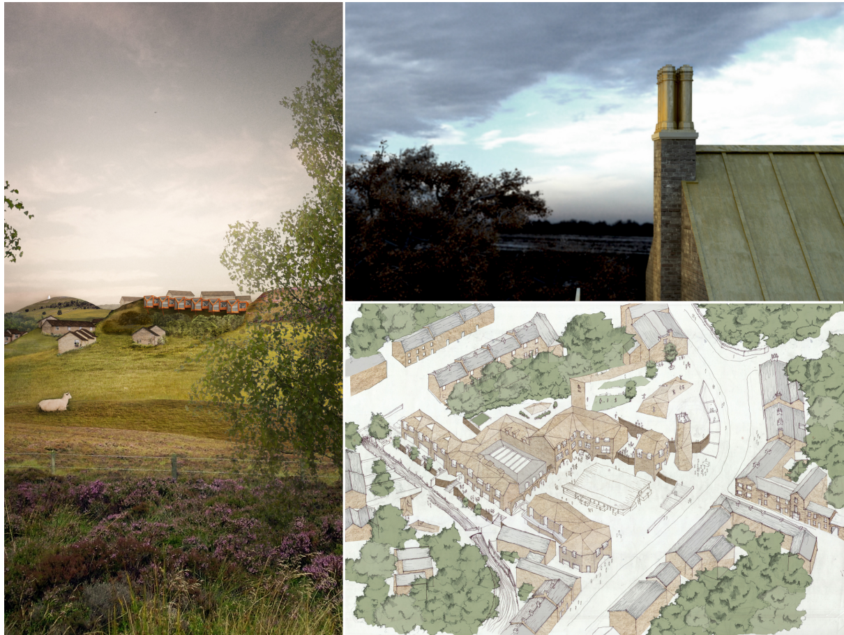
Figure 4. Homes, Dalia Juskaite. Walkers Retreat, James Donegan. Town Square, James Shackleton. Continuity in Architecture, 2016.

The students designed 23 building across the town; this included 80 houses, some live-work communities, a series of public buildings, businesses and leisure facilities, and over 150 car parking spaces, all of which was in line with the objectives of the overarching Neighbourhood Plan. This work was presented in a second exhibition in Bollington, in a joint exhibition with the Policy Documentation for the Neighbourhood Plan. This provided residents with a collective vision for the future of the town.