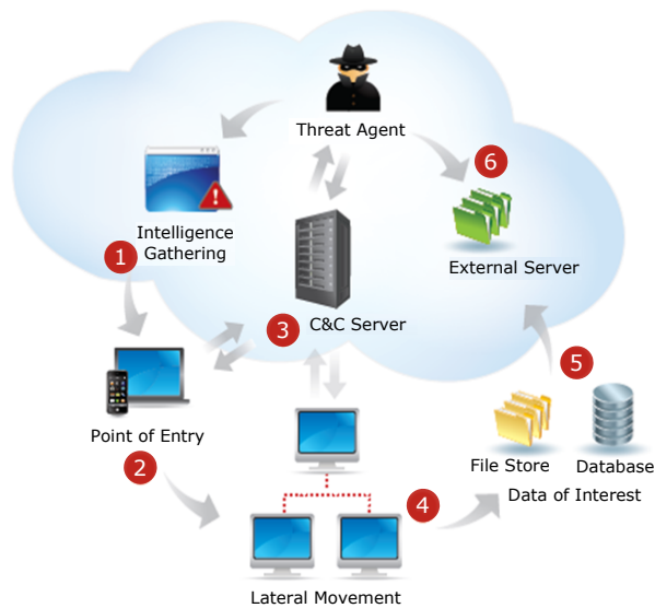
Figure 1: Typical steps of the APT attack.

APT refers to Advanced Persistent Threat. APTs are a cybercrime category directed at business and political targets. APTs require a high degree of stealth over a long period of operation in order to be successful. The attacker usually aims for more than immediate financial gain, and infected systems continue to be compromised even after the target's network has been breached and initial goals reached [5]. Figure 1 depicts the steps of the APT attack [17].