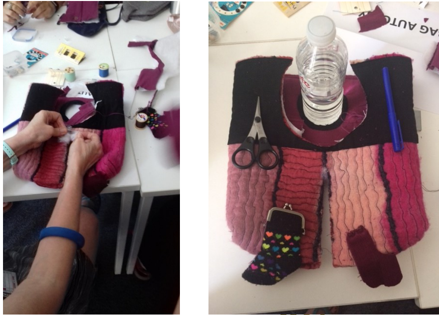
Figure 1 Autopsy

The bags-autopsy research-creation improvisation does not produce pre-determined methodological outcomes but engages new ways to think bags as connective, multiple, affirmative and generative (Van der Tuin, 2015) – bags as companion-species (Haraway, 2008). Bags mobilize regimented striated space (Deleuze and Guattari, 1987) creating something fuzzier, not quite smooth but felted and textured, as both transversal and physical cuts diffract normalized bags meanings and allow us to think bags differently.