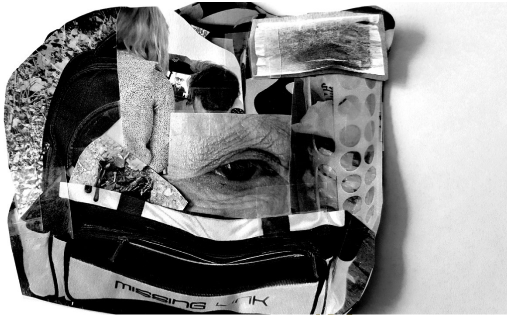
Figure 2 Cut

Cut. Bodies are troubled by those who appeared virtually in bags. Bodies-in-bags (I-Pads, Skype, Neil, Mirka Angelo) as fleeting figures of the absent/present, attendance as virtual and partial contained within bags. How might this text encompass these virtual engagements? How might these multiple I/i as thinking/writing/doing be remembered? Grosz's (1995, p. 21) question about 'the ways in which the author's corporeality ... intrudes into or is productive of the text' helps us re-member (materially reassemble) the traces of the then-virtual, now non-existent conference performances. Bags as unwavering and unwitting participants in their own representational capture of past, current and still-to-be events. Travelling onwards. Still sweaty in hearing those recordings, the virtual-material trace of bodies-in-bag-species.