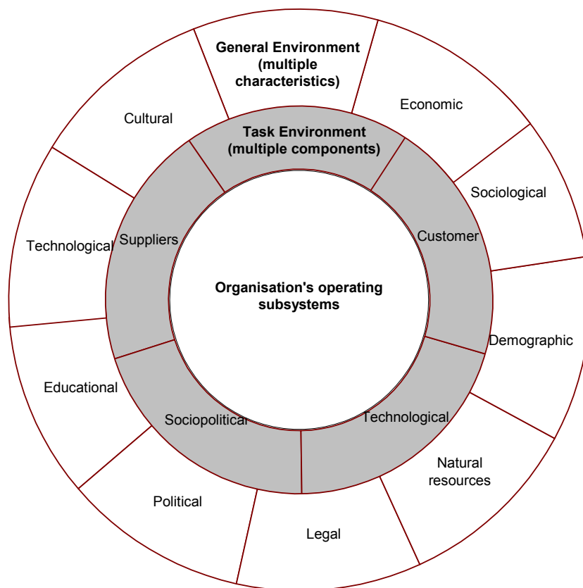
Figure 3: Relationship of general and task environments to the organisation.