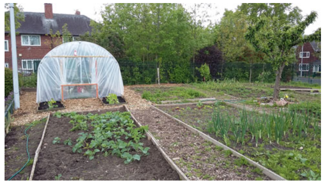
Figure 1. The Macmillan community garden polytunnel.

One of the aims of RFW was to encourage Wythenshawe residents to grow their own food. Of the four group