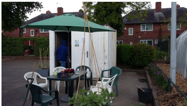
Figure 2. The 'MacDen'.