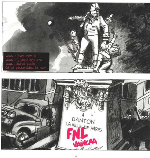
Figure 4: © Editions Casterman S.A./Tardi et Grange : <a href = "HYPERLINK http://www.casterman.com ">Editions Casterman</a>