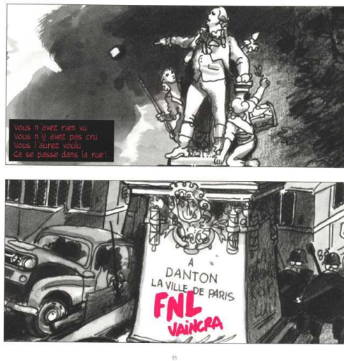
Figure 4: © Editions Casterman S.A./Tardi et Grange : <a href = "HYPERLINK http://www.casterman.com ">Editions Casterman</a>