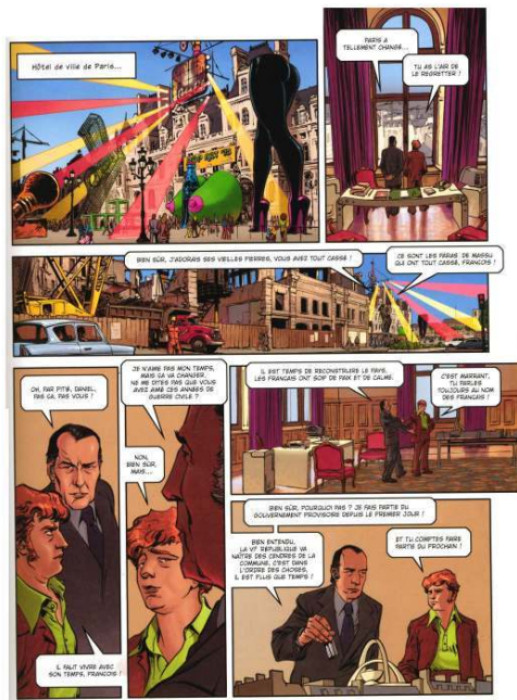
Figure 3: Jour J , volume 6, Duval – Pécau – Blanchard _ Mr Fab © Editions DELCOURT, 2011

with L'imagination au pouvoir ? France reverts to history under a centre-left government: the presidential candidate for the 6 th Republic is Mitterrand's minister Rocard.