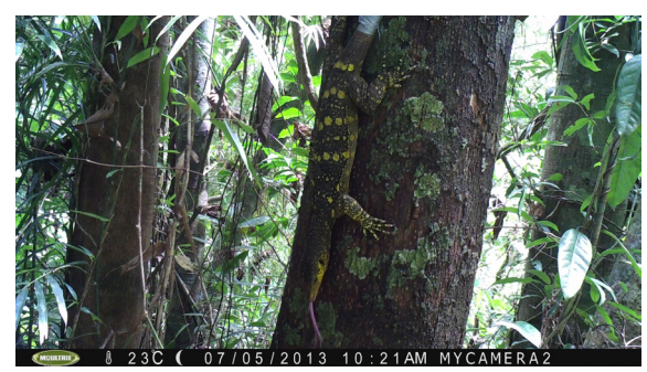
FIGURE 4. Camera trap image of a tagged female Varanus bitatawa in the Northern Sierra Madre Natural Park, Philippines, descending a tree used to shelter overnight.

overlapping range. Support for territoriality is reduced due to the observed shared use of the same fruiting tree by numerous individual V. bitatawa . Most of our captures of V. bitatawa occurred between 1200 and 1400, coinciding with reports from local hunters of a greater success in capture during midday; possibly because the hunting dogs are more likely to pick up the scent of recently moved lizards. Presuming that lizards spend the early part of the morning basking, it can be expected that greater levels of activity and movement would thus be observed at midday.