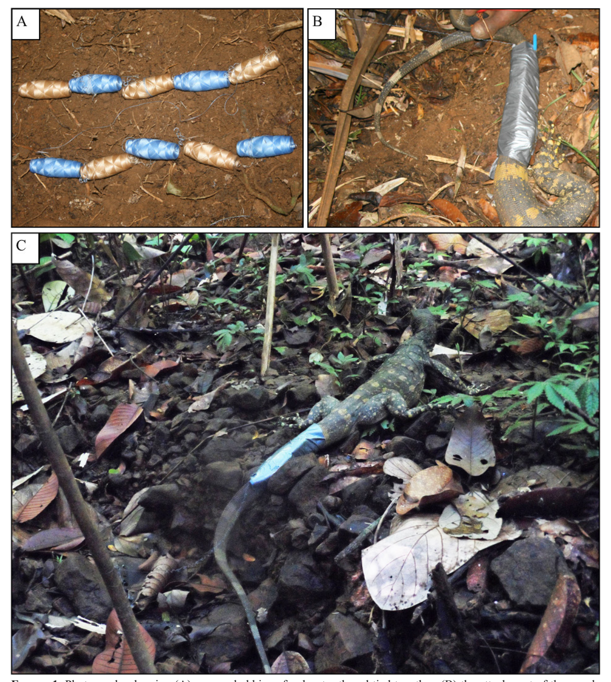
FIGURE 1. Photographs showing (A) cocoon bobbins of polyester thread tied together, (B) the attachment of the spools to the tail of a Varanus bitatawa and (C) Varanus bitatawa at release with a blue tracking line attached to a stem. (Photographed by Stephanie Law).

known tree climbed by a tagged individual. We set cameras to operate continuously for 24 h and to take three photos per second each time the camera was triggered with a 5 s delay between trigger events. A trigger event refers to a series of three pictures taken by the camera within 1 s and capture rate refers to the mean number of trigger events for the duration the camera was left at a particular site.